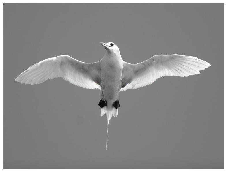
Figure 3. Red-tailed Tropicbird in second basic plumage over the tropical Pacific Ocean 14 April 2006. Note lack of dark tips to primaries and growing p10.