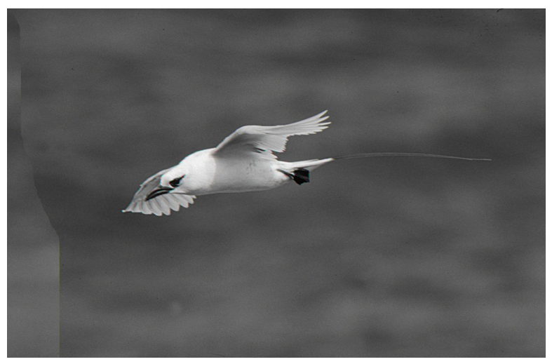
Figure 4. Breeding adult Red-tailed Tropicbird at Midway Island, Hawaii, 15 February 2001.