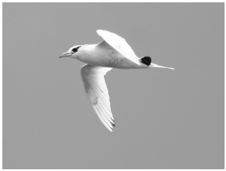
Figure 1. Immature Red-tailed Tropicbird over the tropical Pacific Ocean, 9 April 2006. Note the dark tips to p9, p8, and p7 and mostly yellow bill.