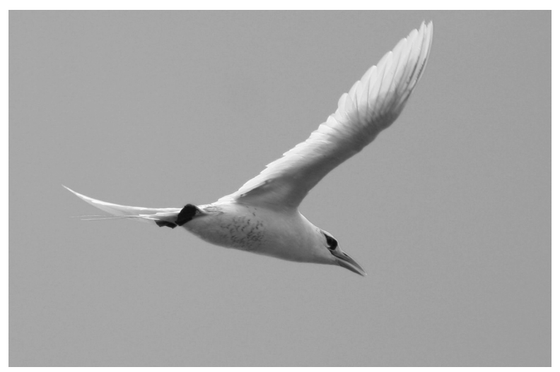
Figure 2. Red-tailed Tropicbird in late second basic plumage over the tropical Pacific Ocean 9 April 2006. Note the worn and faded p9 and p10.