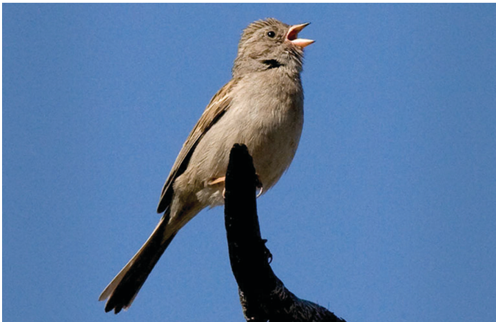
Figure 2. Hybrid Brewer's × Black-chinned Sparrow in Cuyamaca Rancho State Park, California, 9 June 2007. Note bright yellowish pink bill, pale supercilium, and uniform grayish cheek and underparts.