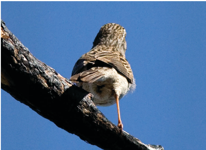
Figure 3. Upperparts of Brewer's × Black-chinned Sparrow in Cuyamaca Rancho State Park, California, 9 June 2007. Note streaked crown and nape and sandy brown background color of the crown and back. From this view the bird does not look clearly different from a pure Brewer's Sparrow.