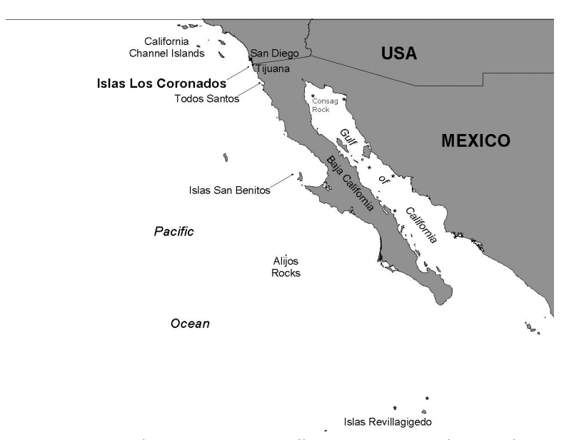
Figure 1. Location of the Coronado Islands off the northwest coast of Baja California, Mexico, in relation to principal breeding colonies (marked with asterisks) of the Brown Booby in northwestern Mexico.