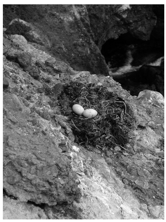
Figure 4. Two-egg clutch in Brown Booby nest A on Middle Rock, Coronado Islands, 24 March 2005.