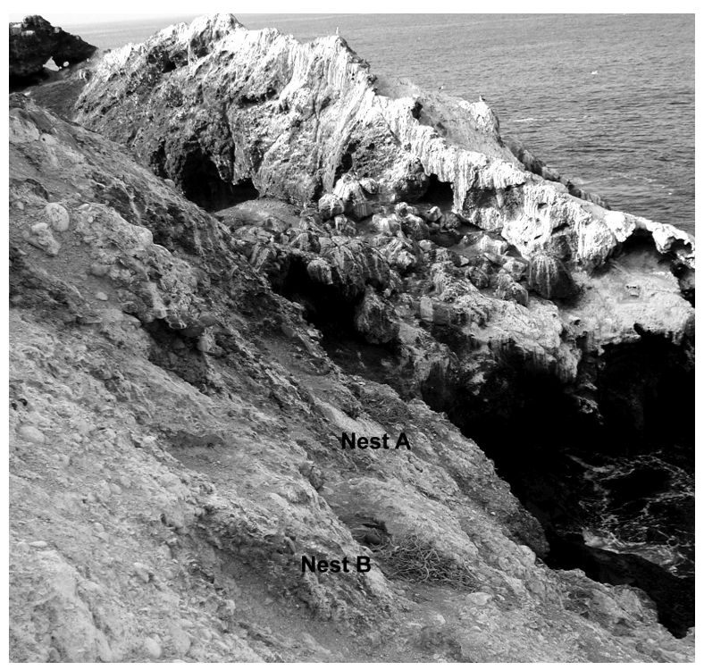
Figure 3. Two Western Gull nests attended by Brown Boobies at Middle Rock, Coronado Islands, 17 May 2002 (nest B foreground; nest A background).