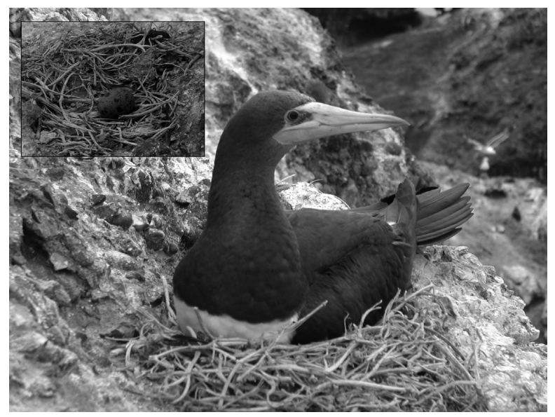
Figure 2. Adult female Brown Booby in incubation posture on Western Gull nest A at Middle Rock, Coronado Islands, 17 May 2002. Inset: Western Gull egg in nest.