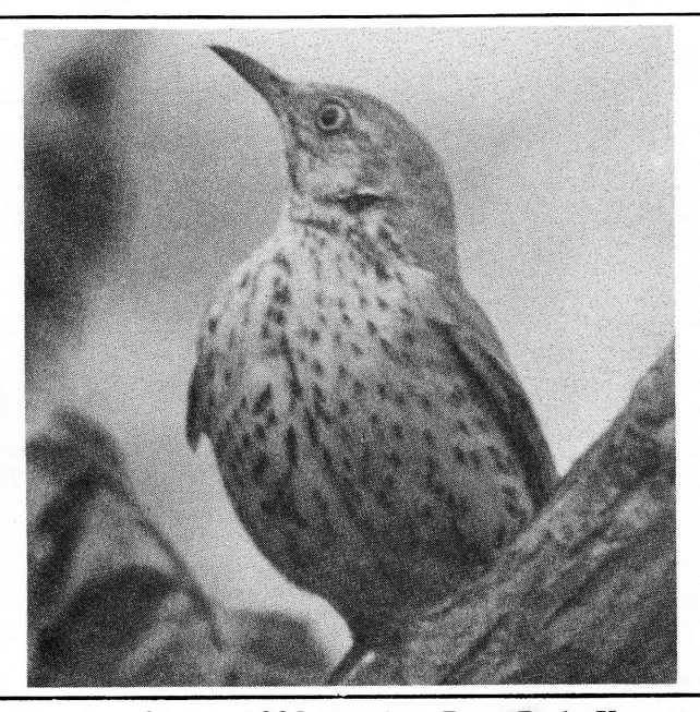
Adult Sage Thrasher, 21 July 1985, Rondeau Prov. Park, Kent.

These are the first, second and fourth of four records now known for Ontario. The 21 July 1985 record is particularly remarkable as it occurred in summer, a season for which there are no vagrant records in Ontario of any passerine species originating from western North America; perhaps it can be theorized that the bird arrived during spring migration and lingered until its discovery date in July.