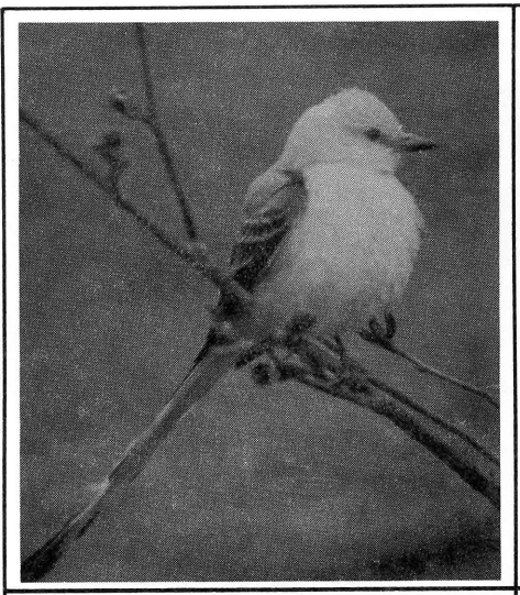
Scissor-tailed Flycatcher, 16-26 May 1984, Thunder Bay, Thunder Bay.