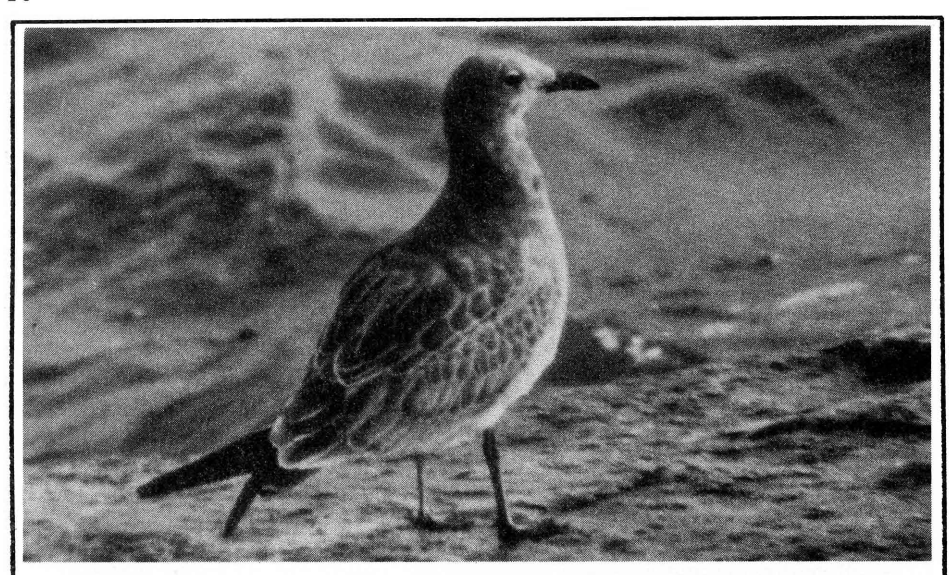
Juvenile Laughing Gull, 5 Sept. 1985, Southeast Shoal, Essex .

—juvenile, 29-31 Aug., Marentette Beach, Essex (Alan Wormington, Karl Overman)—photo on file.