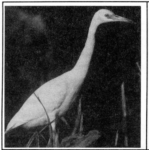
Juvenile Little Blue Heron, 18-25 Aug. 1977, Rattray's Marsh, Peel .