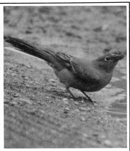
Townsend's Solitaire, 22 April-10 May 1981, Point Pelee Nat. Park, Essex.