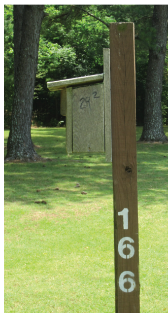
Figure 1. An Eastern Bluebird box at Percy Warner Golf Course in Nashville where the nestling was banded.

On 2 May 2016, #2251-20687 was captured by licensed bird bander Ann Wick. This female was incubating six eggs in nest box #75 in Black Earth, Dane County, Wisconsin (43.14138°, -89.70797°. Figure 2) approximately 822 km (511 miles) NNW of Nashville. At this time she was 5 years, 10 months old. The oldest known Eastern Bluebird lived 10 years, 6 months (USGS 2021), although most bluebirds (50 percent of adults, 75 percent of young) will die during a typical year (Pitts 2011). Five of the six