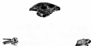
Figure 2: 1. Internal view of carpometacarpus (proximal half); greatest breadth of proximal extremity - 7.55 mm* 2. Left of premaxilla; length of nares - 4.15 mm; width of nares - 4.60 mm 3. Right view of pygostyle; length - 12.80 mm; width at waist - 5.30 mm