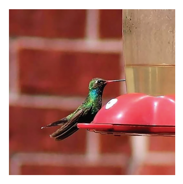
Figure 1. First Tennessee record of Broad-billed Hummingbird photographed on a feeder in Arlington, Shelby County, Tennessee.

With Amber's permission, I posted this sighting on eBird and submitted the record to the Tennessee Bird Records Committee. This committee approved this observation as the first state record for Broad-billed Hummingbird (The Migrant 89:99-100).