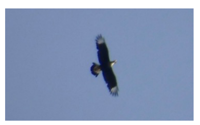
Figure 2. The Crested Caracara banked overhead at Island 21 in Dyer County, Tennessee. Photo credit: Mark Greene

Figure 1. The original observation was of the Caracara sitting on a rock jetty near Booth Point, Mississippi River, Dyer County. The photo was digi-scoped with an iPhone 6 camera at a considerable distance through significant heat shimmer. Photo credit: Mark Greene