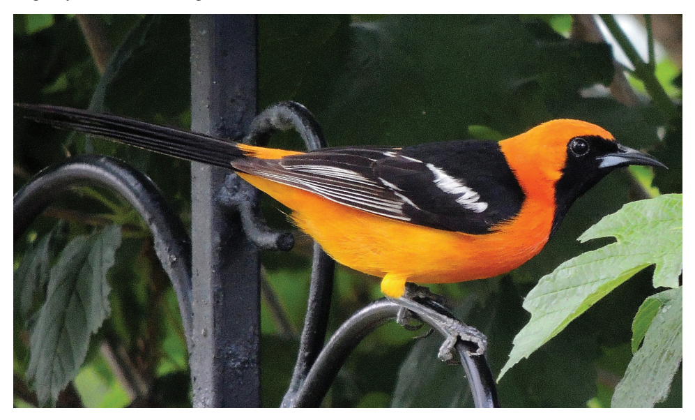
Figure 1. This Hooded Oriole was photographed on a feeder in Giles County, Tennessee representing the first accepted Tennessee record of this species.