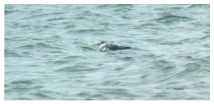
Figure 2. Black-capped Petrel, Tennessee's first record of this species, photographed on Pickwick Lake.

petrel ( Pterodroma spp), most likely a Black-capped. I was able to photograph and see it well enough to rule out any of the other less-likely Atlantic Pterodromas species (Figure 2). At one point, after getting a few digiscopes, I had to change position due to the birds drifting behind some trees on the shore. I moved briefly to reposition my optics, but was unable to find the bird again. It is possible the bird expired on the water as it was not seen again after repeated scanning of the lake by me and other birders who arrived later that afternoon.