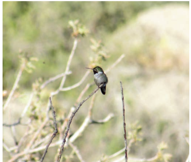
Figure 2. An example of a male Broad-tailed Hummingbird perched on his territory near Flagstaff.