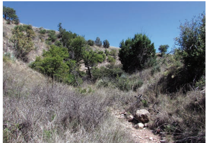
Figure 3. The typical ephemeral riparian habitat where I found male Black-chinned Hummingbird territories in southeastern Arizona. This photo was taken at the Appleton-Whittell Research Ranch.

The situation changed once I started observing Black-chinned Hummingbird territories in southeastern Arizona. I first tried to locate male territories at the Patagonia-Sonoita Creek Preserve (c. 1200 m; May 2014), but despite finding many males at feeders in the area, I could not find male territories. At the Appleton-Whittell Research Ranch (AWRR) of the National Audubon Society near Elgin (c. 4800 m), I found 10-15 male territories that were easily defined (May-June 2015 and 2016)—like the Broad-tailed Hummingbird territories defined above. AWRR is mostly upland grassland, but several ephemeral washes run through the property, and it was along the canyons and ridges of these riparian habitats where I found male territories (Figure 3). Male Black-chinned Hummingbirds also perched in several conspicuous branches of trees, and I tended to find them in oak, mesquite, and juniper trees (Figure 4). The dispersion of male Black-chinned Hummingbird territories was different here than what I