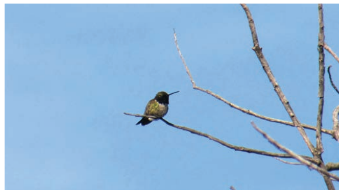
Figure 4. An example of a male Black-chinned Hummingbird perched on his territory at the Appleton-Whittell Research Ranch.