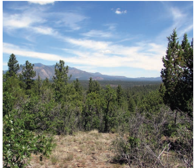
Figure 1. The typical piñon-juniper habitat where I found male Broad-tailed Hummingbird territories near Flagstaff. This photo was taken from Forest Road 128.

Male Broad-tailed Hummingbirds in these areas seemed to exhibit more exploded lek-based territorial behaviors, as I would rarely find males feeding on their territories. In fact, males typically disappeared from their territories for several minutes to an hour, presumably to feed elsewhere. Because the males near Elden Spring were close to a neighborhood, I often found them leaving their territories and flying directly toward the neighborhood, most likely to feed at hummingbird feeders. If another hummingbird—male or female—ever appeared in a male's territory, he would usually chase it away, and thus these males guarded their territories fervently. However, if the intruder was a female, I would often hear males dive-and-shuttle displaying to them before chasing them off. These observations are similar to those reported elsewhere in