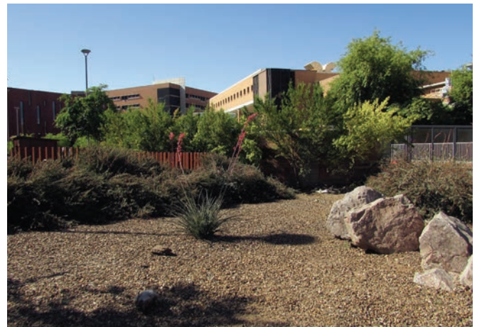
Figure 5. The typical habitat on Arizona State University's Tempe campus where I found male Anna's Hummingbird territories.

Male Anna's Hummingbirds mostly perch on palo verde trees or ocotillos (Figure 6), which is very similar to what I observed with Costa's Hummingbirds in the Mohave deserts of California. Unlike male Broad-tailed or Black-chinned hummingbirds, Anna's Hummingbirds sing while on their territories, which they also use for courtship.