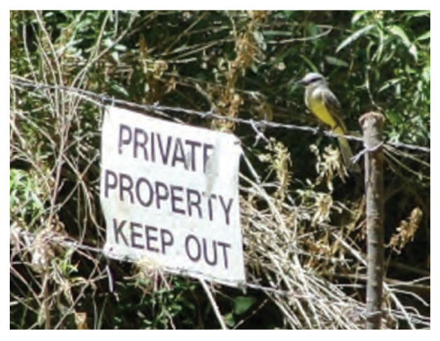
Figure 2: Tropical Kingbird at San Pedro River near San Manuel, 6 June 2011.

Tropical Kingbirds are still found at a few of the previously known outlier sites, such as the San Bernardino National Wildlife Refuge (NWR) in southeastern Cochise County and Hassayampa River Preserve in northwestern Maricopa County. The latter is a well-