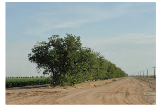
Figure 4: Tropical Kingbird nesting habitat in a single row of pecan trees at A Santa Cruz Flats. Photo by Doug Jenness

Reservoir roads and Picacho Highway. These reports included a single bird Santa Cruz Flats. Photo by Doug Jenness on 10 September 2008 on Wheeler Road just north of Baumgartner Road (AZFO Seasonal Reports 2008) and an adult with two fledglings three days