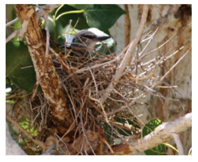
Figure 3: Tropical Kingbird on nest in a cottonwood at 'Ahakhav Tribal Preserve, 1 July 2012.

Although there had been a few sightings of Tropical Kingbirds during the breeding season along the lower Colorado River valley since 1947 (Rosenberg et al. 1999), the first confirmed nesting was not until 2011 (AZFO Seasonal Reports 2008). In that year a pair was documented nesting at the 'Ahakhav Tribal Preserve along the Colorado River south of Parker in La Paz County. The pair was confirmed nesting and built three nests before successfully fledging young. Nesting occurred again in 2012 with one nestling fledged (Fig. 3).