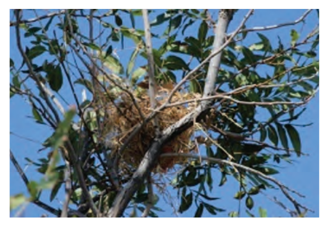
Figure 6: Tropical Kingbird nest in a pecan tree along Tweedy Road at Santa Cruz Flats, 15 July 2013.

The discovery of the Santa Cruz Flats breeding population is especially noteworthy because of its concentration in a relatively small area and its breeding in pecan trees, a nest location that was previously known to be