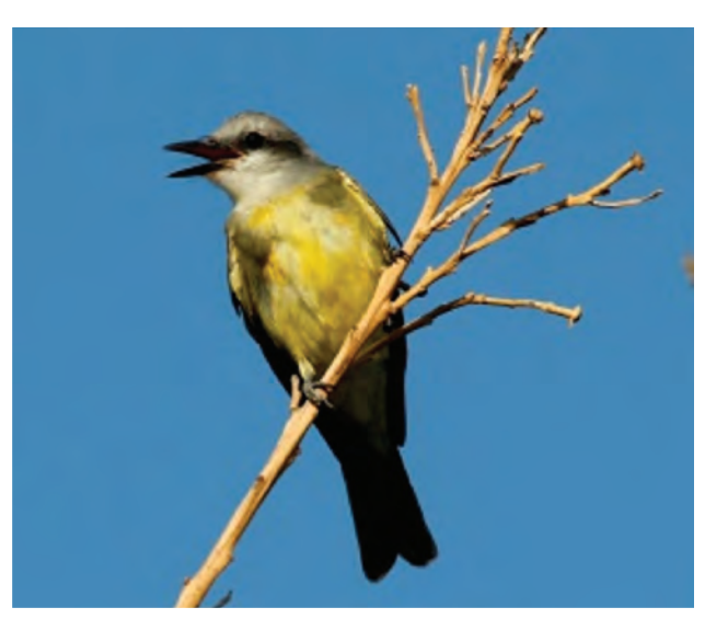
Figure 1: Fledgling Tropical Kingbird, Santa Cruz Flats, 7 August 2013.

The occurrence of Tropical Kingbird in Arizona is relatively recent and its numbers and range are expanding. Its known history in the state began with a bird collected at Fort Lowell near Tucson in 1905, but this species was not reported again until Phillips (1940) discovered it nesting south of Tucson between Midvale Farms and the San Xavier Mission area in