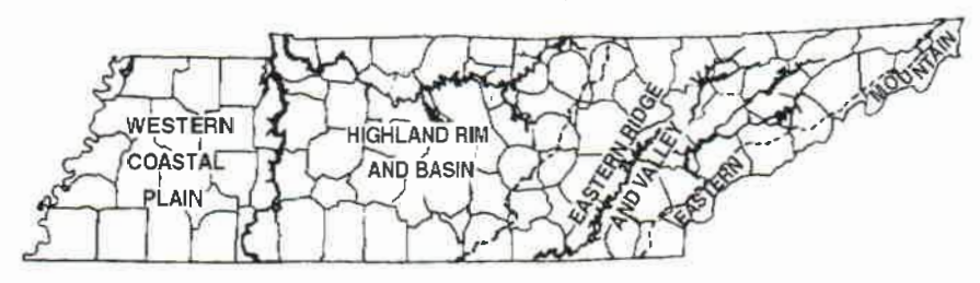
1 MARCH - 31 MAY 2010

Following a rather cold winter, March temperatures were near normal, while April and May were several degrees warmer than average. Rainfall varied widely from a flood-causing cloudburst in Middle Tennessee to rather dry conditions in the two eastern regions. Despite the mildness, most observers commented that migrant passerines were generally late and in low numbers this spring.