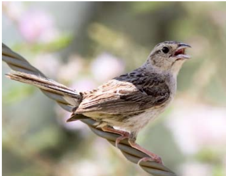
Figure 1: Cassin's Sparrow - Photo by Oliver Niehuis.

Before 1965 Cassin's Sparrow ( Aimophila cassinii ; Figure 1) had not been documented as a breeding species in Arizona (Philips et al. 1964). Singing and skylarking males had been observed during the late summer monsoon seasons in southeastern Arizona, but some authorities at the time proposed that these birds were postbreeding visitors from the principal nesting areas in Texas and that they were simply going through the motions of displaying (Philips 1944). In 1965, three nests were found seven miles southeast of Tucson (Ohmart 1966). Since this discovery, Cassin's Sparrow has been documented as a regular breeder in southeast Arizona grasslands (Monson and Philips 1981). Surveys in the 1990s for the Arizona Breeding Bird Atlas confirmed breeding in Yavapai, Pima, Cochise, and Graham Counties, probable breeding in Santa Cruz County, and possible breeding in Greenlee and Apache Counties (Corman 2005).