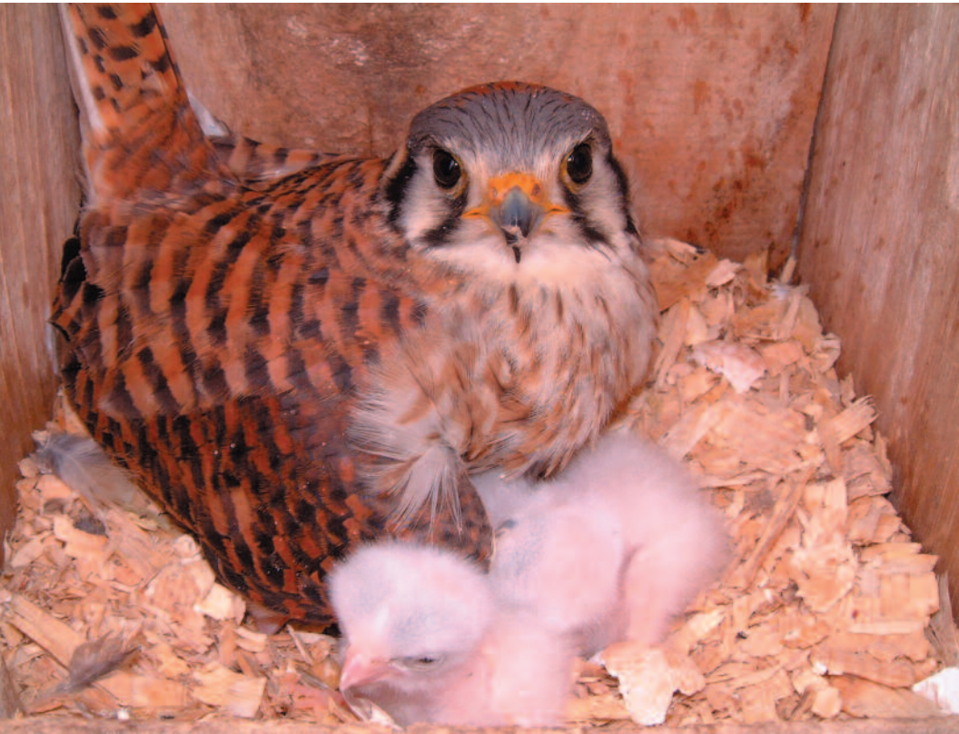
Figure 1. Recently hatched American kestrel chicks with adult female.