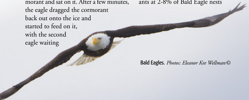
Bald Eagles.

Todd et al. (1982) mention seeing "... occasional cooperation between two hunting eagles." They also reported finding remains of Double-crested Cormorants at 2-8% of Bald Eagle nests