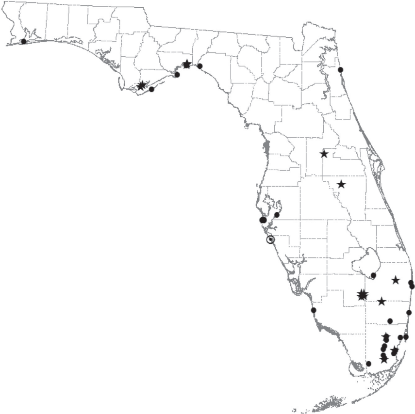
Figure 3. Distribution in Florida of Tropical/Couch's kingbird records, 1986-mid-2016 ( n = 56 ). Fourteen records pertain to Tropical Kingbirds, 15 others to presumed Tropical Kingbirds, two to purported Couch's Kingbirds, and 25 were not assigned to species. Winter records (December-February; n = 19 ) are represented by stars, non-winter and non-breeding records (March-November; n = 33 ) are represented by circles, and the four successful Tropical Kingbird breeding records in Sarasota County are represented by the open circle.

the southwestern United States or Mexico, climatic changes associated with a warming planet, or other causes must for now remain conjectural.