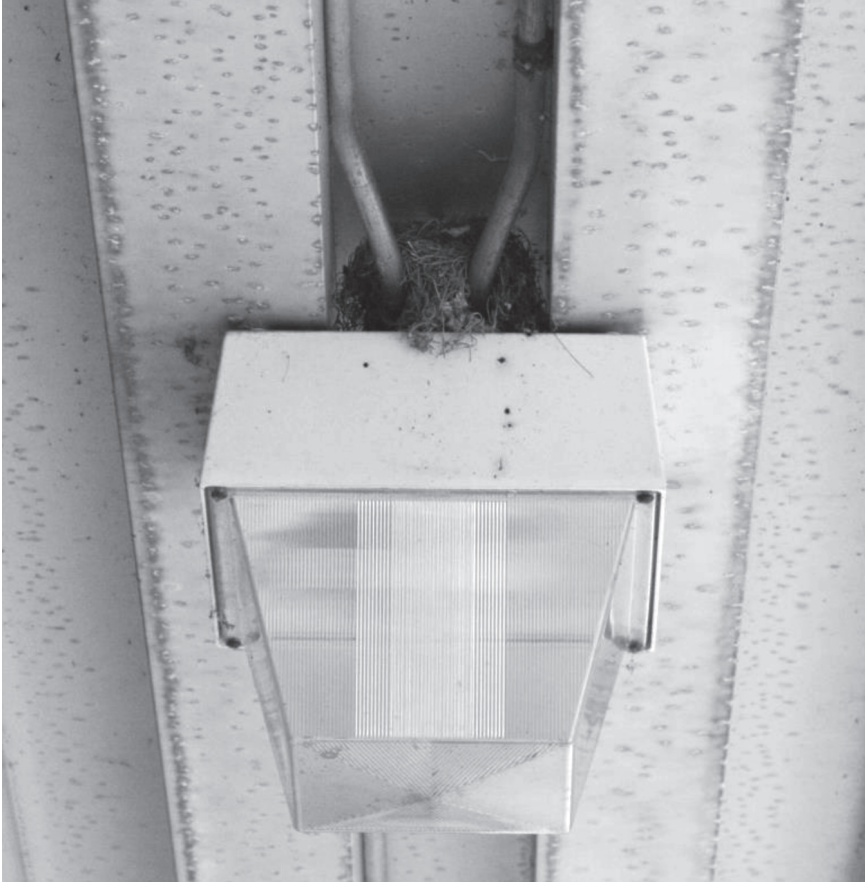
Figure 1. Example of a House Finch nest placed in a “light” nest site, situated between a light and the aluminum roof of a breezeway.

individuals show hatching failure rates that average 21.6 \pm 5.6 percent (Briskie and Mackintosh 2004). We documented an average hatching failure rate of 20.1 \pm 4.5 percent for this introduced population of House Finches. Reduced genetic diversity can increase hatching failure (Bensch et al. 1994, Kempenaers et al. 1996, Hansson 2004, Spottiswoode and Moller 2004, Mackintosh and Briskie 2005) and introduced populations of House Finches have lower allelic richness and heterozygosity relative to native populations, indicating decreased genetic diversity (Hawley et al. 2006). Our data are consistent with the hypothesis that reduced genetic diversity could be causing high rates of hatching failure in this population, but the data need to be compared to hatching failure rates of native populations of House Finches. A native House Finch population in Arizona had a hatching failure rate of 12.9%