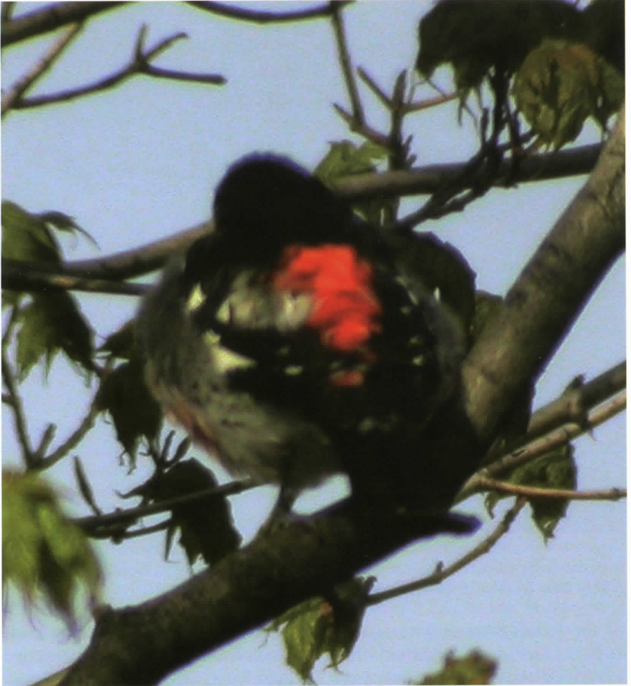
Figure 2: Erythristic male's red rump is white (rarely pink) in typical male Rose-breasted Grosbeak and cinnamon-brown in typical male Black-headed Grosbeak.

Grosbeak. It is also conceivable that alterations in the program of pigment patterning in the Rose-breasted Grosbeak could produce individuals with red pigmentation over a wider area of the body (including the flanks and rump) than is currently observed, as sug-