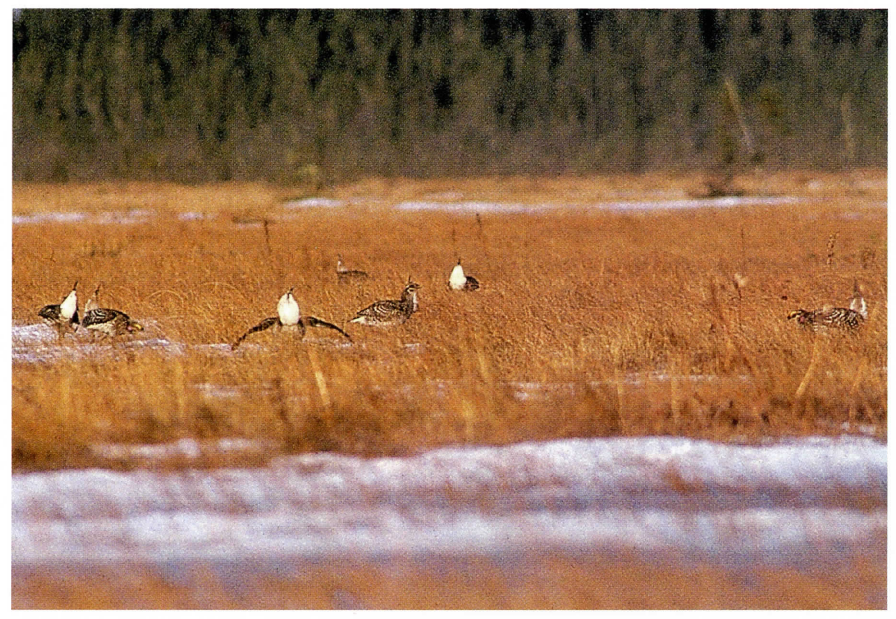
Figure 4: Group of Sharp-tailed Grouse dancing at the Trewartha Township peatland on 10 April 1994.