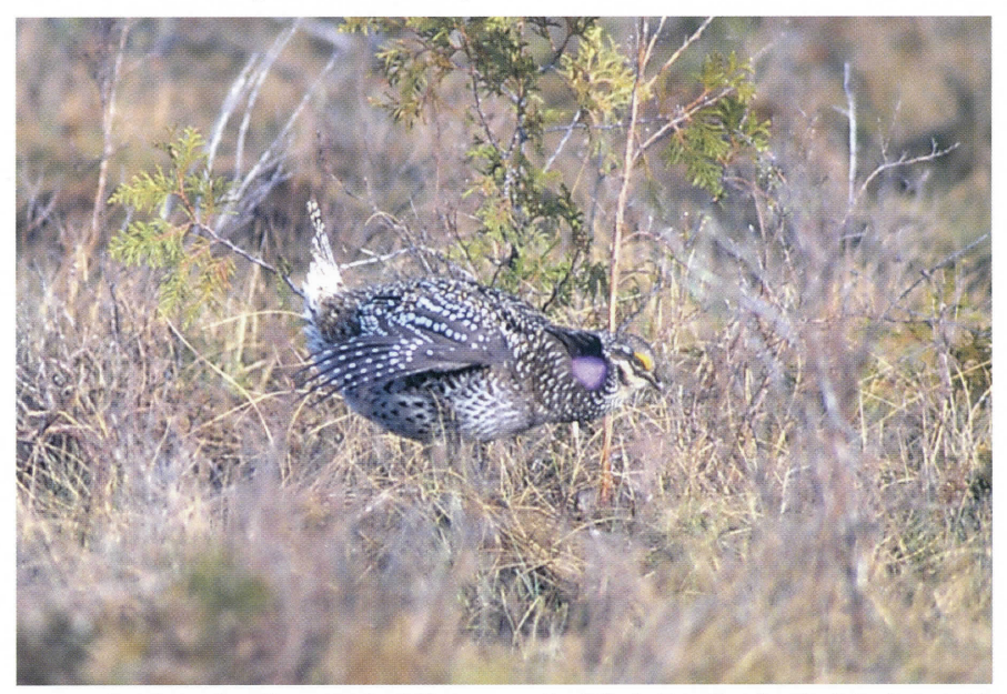
Figure 3: Displaying Sharp-tailed Grouse at the Black Bay Peninsula lek site on 30 April 2000.