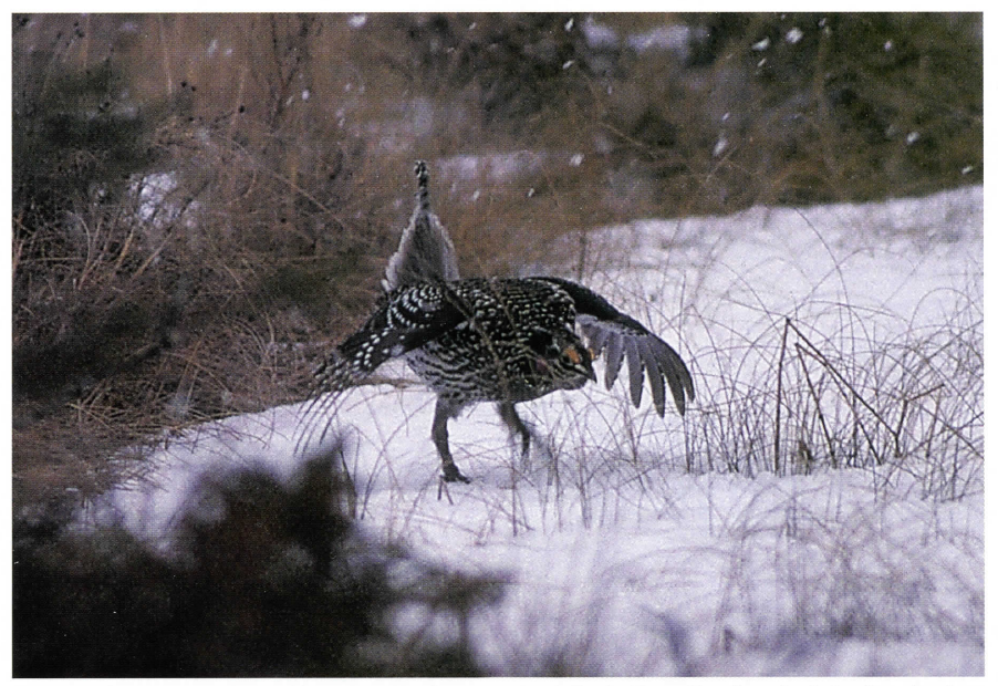
Figure 2: Sharp-tailed Grouse dancing at the Black Bay Peninsula lek site during snow flurries on 1 April 1994.