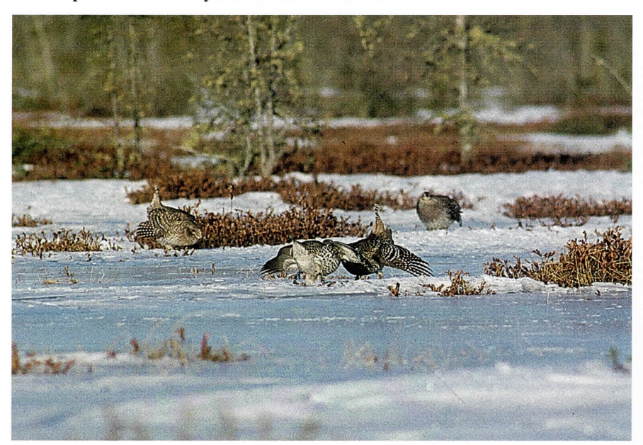
Figure 5: Sharp-tailed Grouse facing off on the ice at the Muskeg Lake fen on 12 April 1997.