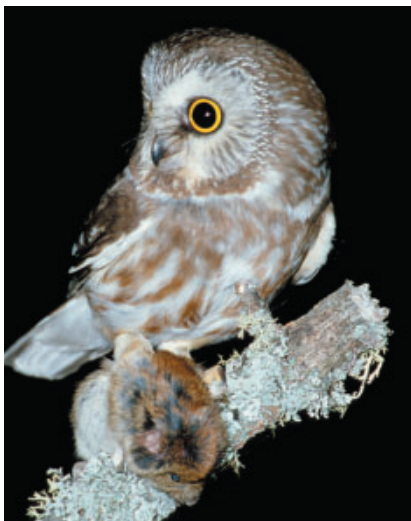
Figure 4: Northern Saw-whet Owl with Southern Red-backed Vole ( Clethrionomys gapperi ).

APO 170-500mm lens and 2 Metz flashes were used, with Fujichrome Provia film (400 ASA). A small 4.8v flashlight with a sawed-off reflector, run by a 12v battery, was placed between the tower and the nest to provide just enough light to see the arriving owl and to focus. Most of the time, the lens was pre-focused on the cavity entrance or the perch. This technique was modified from Pukinski (1976).