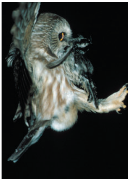
Figure 10: Northern Saw-whet Owl with Black-and-white Warbler ( Mniotilta varia ).

almost all of the food for the female and young, while females incubate the eggs and brood the young until the youngest nestling is about 18 days old. Thus, it is safe to assume that the owl that emerged from the nest cavity shortly after dark and quickly returning to the nest was the female, and another one that arrived with food was the male. The Northern Saw-whet Owl is known to store uneaten food on tree branches during winter (Bondrup-Nielsen 1977), and Cannings (1993), reported that males often bring an excess of food to the nest, especially during egg laying. My observations suggest that males may store food from a previous night or perhaps store at least one item on the same night before bringing food to the nest. On 26 May,