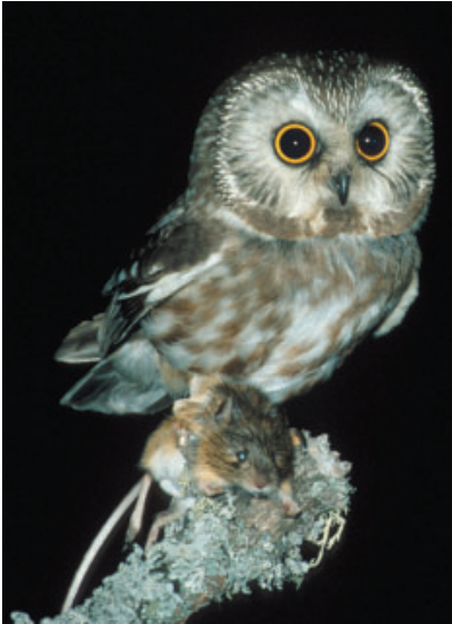
Figure 6: Northern Saw-whet Owl with Meadow Jumping Mouse ( Zapus hudsonius ).