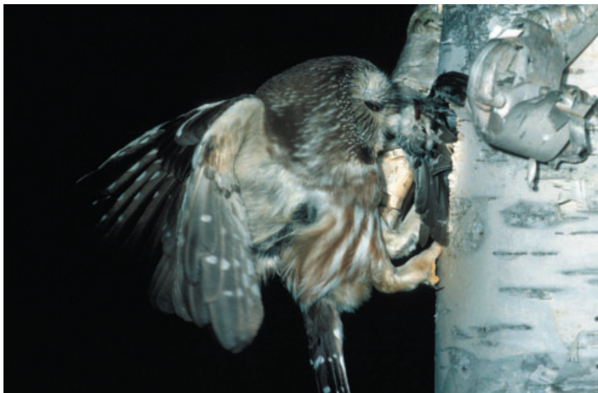
Figure 9: Northern Saw-whet Owl with White-crowned Sparrow ( Zonotrichia leucophrys ).