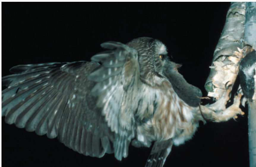
Figure 8: Northern Saw-whet Owl with Smoky Shrew ( Sorex fumeus ).