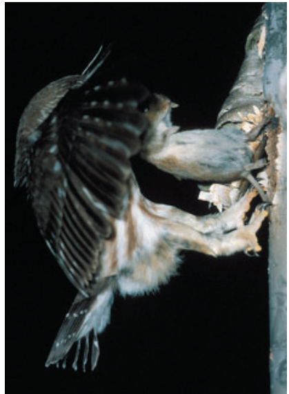
Figure 3: Northern Saw-whet Owl with Meadow Vole ( Microtus pennsylvanicus ).