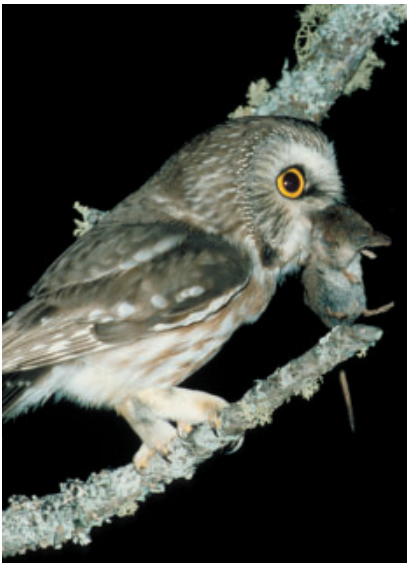
Figure 7: Northern Saw-whet Owl with Masked Shrew ( Sorex cinereus ).

tographed by me. Every image obtained during photo sessions at the owl nest was compared to those kept in my personal photo library.