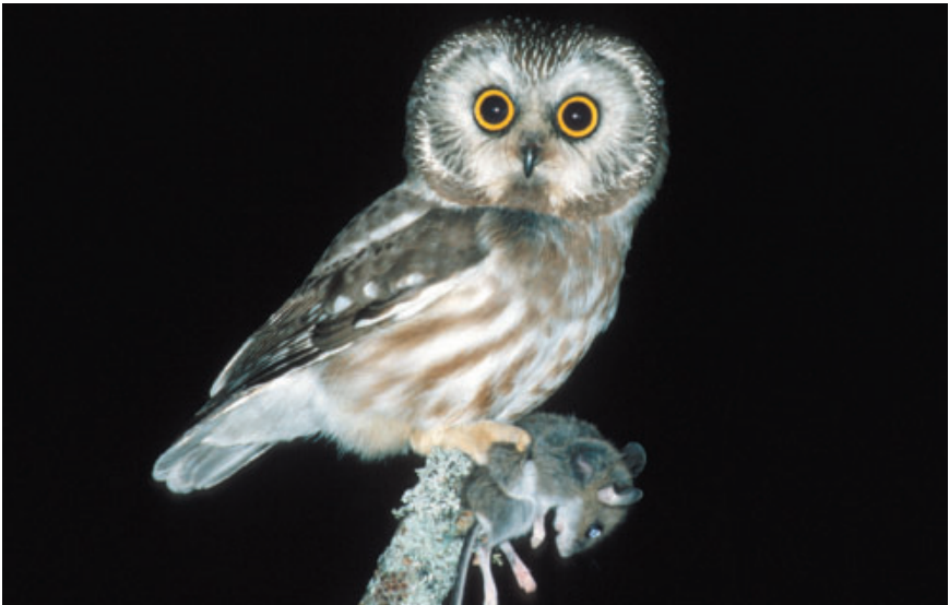
Figure 1: Northern Saw-whet Owl with immature Deer Mouse ( Peromyscus maniculatus gracilis ).

Although the Northern Saw-whet Owl is one of the most common owls in forested habitats of Canada and the northern United States, much remains to be learned about its behaviour and breeding biology (Cannings 1993). Published information on the breeding season diet of this species was mostly determined from the analysis of pellets and prey remains recovered from nests