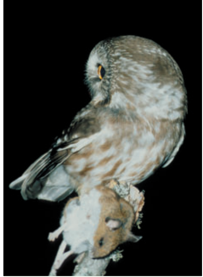
Figure 2: Northern Saw-whet Owl with adult Deer Mouse ( Peromyscus maniculatus gracilis ).

A 3.5 m tower built of wooden 2" x 4"s was fitted with a fabric blind on top. The tower was moved to the vicinity of the nest (about 5 m away) on 12 May after the young had hatched. A dead sapling was planted about 3 m from the cavity to provide an obvious perch. A Nikon F90X camera fitted with Sigma