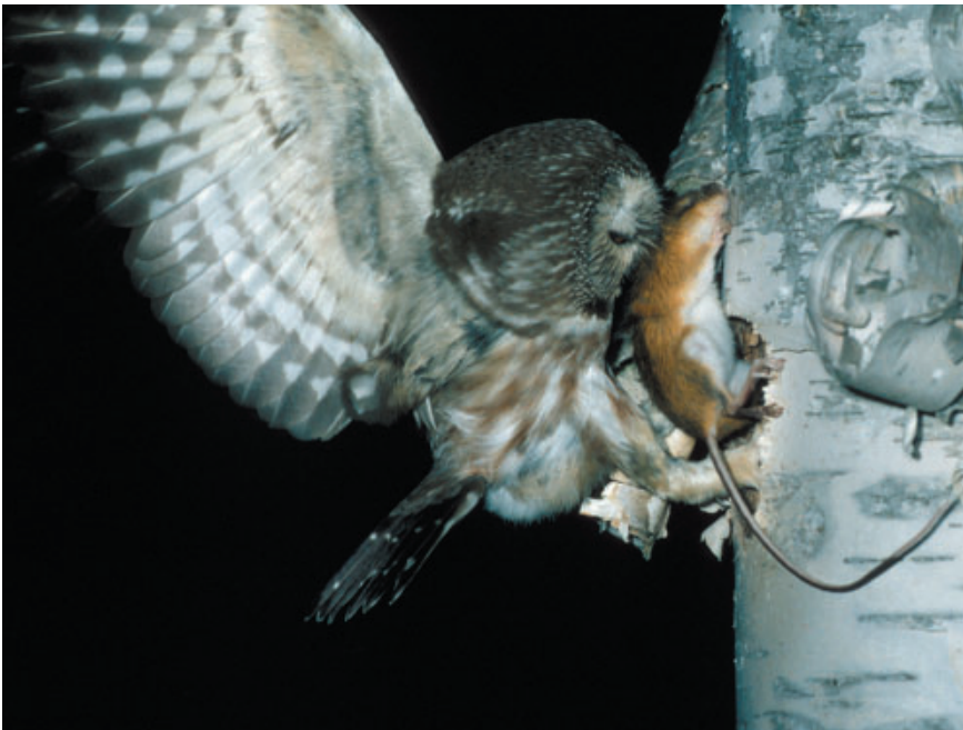
Figure 5: Northern Saw-whet Owl with Woodland Jumping Mouse ( Napaeozapus insignis ).