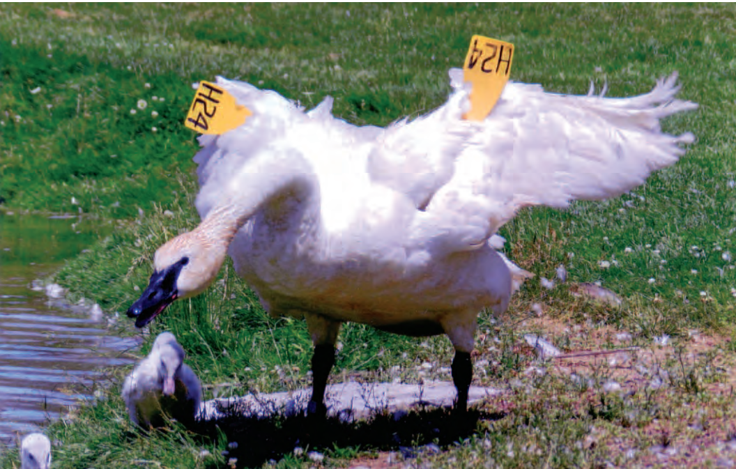
Above: Figure 6. Wing rattling display in defence of a brood.