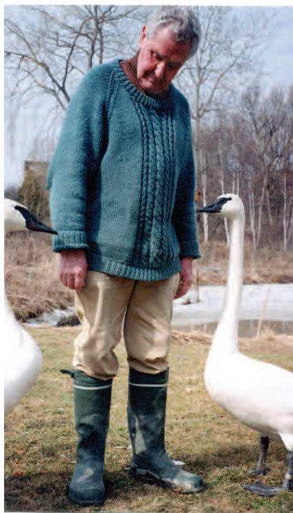
Figure 1. Female Trumpeter Swan (bird on the right) that courted by pressing her breast to the author's thigh.