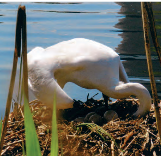
Figure 4. Female Trumpeter Swan stirring her eggs.

The timing of nest building relative to physiology is of interest. Using Grau's (1976) technique for measuring rapid yolk development, I found that Mute Swan yolks took \bar{x} 9.17 \pm 0.44 days (range 9-10, N=6) to develop in the ovary before the follicle ruptured and the yolk entered the oviduct (Lumsden, unpublished). It is assumed that yolks of Ontario Trumpeters have a similar speed of development. If we allow two days for albumen, membrane and shell deposition, RYD would begin about 11-12 days before laying (see also Alisauskas and Ankney 1992). Most clutches (63%) in Ontario were initiated during 21-30 April (Lumsden 2016). RYD would have begun about 10-18 April. I have seen nest building behaviour as early as mid-March in years when the first eggs appeared about 1 April. Thus it seems that Trumpeters start nest building just before RYD begins.