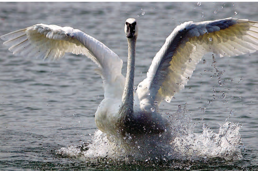
Above: Figure 8. Wing flap display. A threat with vigorous stamping.