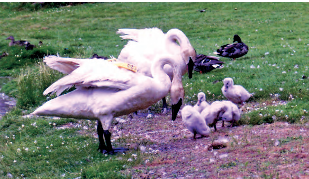
Below: Figure 7. Curved neck display in defence of a brood.