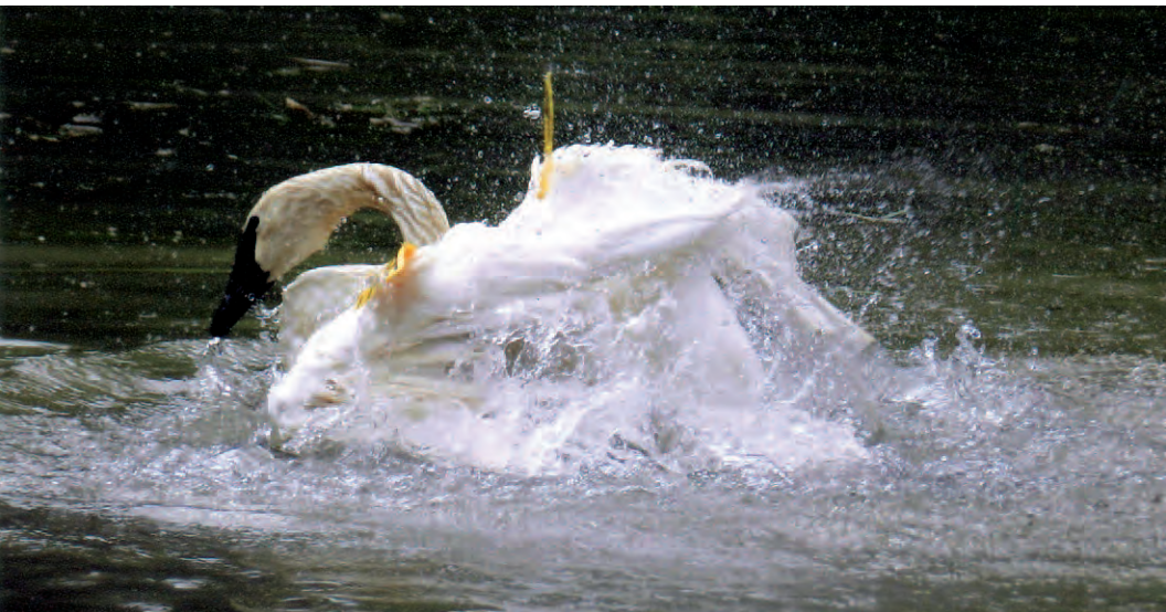
Figure 2. When bathing, the swan thrashes the water with its wings.

Trumpeters bathe frequently but particularly after a fight and after copulation.