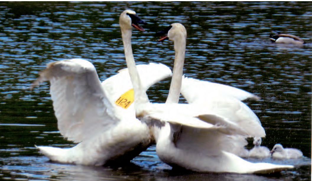
Figure 5. Wing quivering display in defence of brood.

There was a totally different response from H24 when I again confronted him at close range when he was guarding his 15 day old brood. He threatened me with curved neck, lowered head and wings raised but unspread primaries. He vigorously shook his wings (Figure 6). Note in