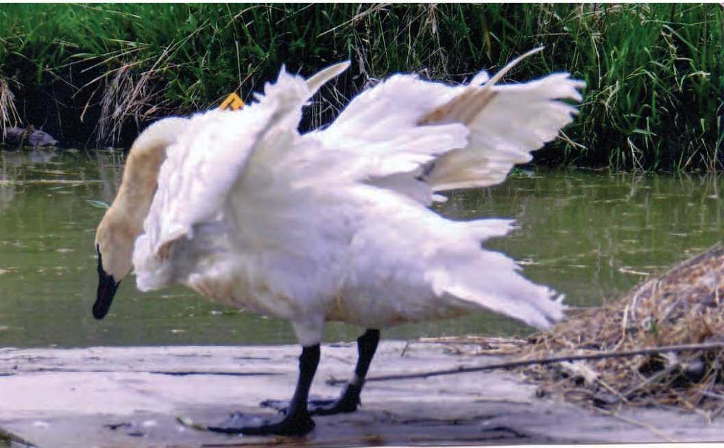
Figure 3. When drying after bathing, the swan vigorously shakes its wings.

All species of swans and geese seem to have a deep seated aversion to making physical contact with one another, in particular Trumpeters and Canada Geese ( Branta canadensis ) (Lumsden, pers.obs.). They do not allopreen (i.e., preen other individuals) and they strictly maintain individual distance (Conder 1949), which develops in the brood period and prevails throughout life. The only exceptions occur in courtship and copulation and when females brood cygnets. Swans ensure physical isolation by threat when another swan approaches within a body