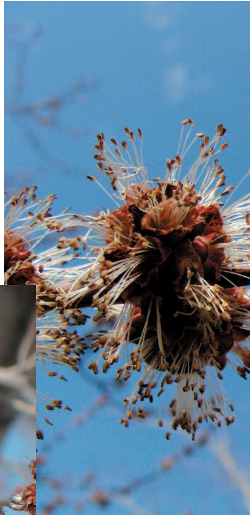
Figure 4. Bohemian Waxwing feeding on the maple tree, note that the bird has three anthers in its bill and that most of the stamens have been nipped off the flowers directly in front of it. Markham, York, 5 April 2008.