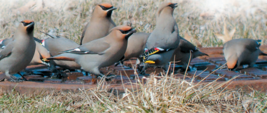
Figure 2. Nine Bohemian Waxwings drinking from meltwater on manhole cover at Markham, York, 5 April 2008.

that the birds might be after the pollen instead. I investigated further using my telescope, concentrating on one feeding waxwing. The bird appeared to be plucking off and eating only the stamens, leaving the small red petals intact on the flowers that it was feeding on. It required much concentration and time to see the bird swiftly plucking off the stamens, even with the help of a scope at close distance. At this point, I digiscoped many photographs of a feeding bird, including two series of continuous burst mode photos. Afterwards, by examining one of these series frame by frame, I was able to confirm that the bird was eating only the stamens (filaments and anthers), while the outer parts of the flowers remained untouched from the first frame to the last (Figure 4). These photos provide material evidence of the Bohemian Waxwing consuming stamens from a Silver Maple tree in spring.