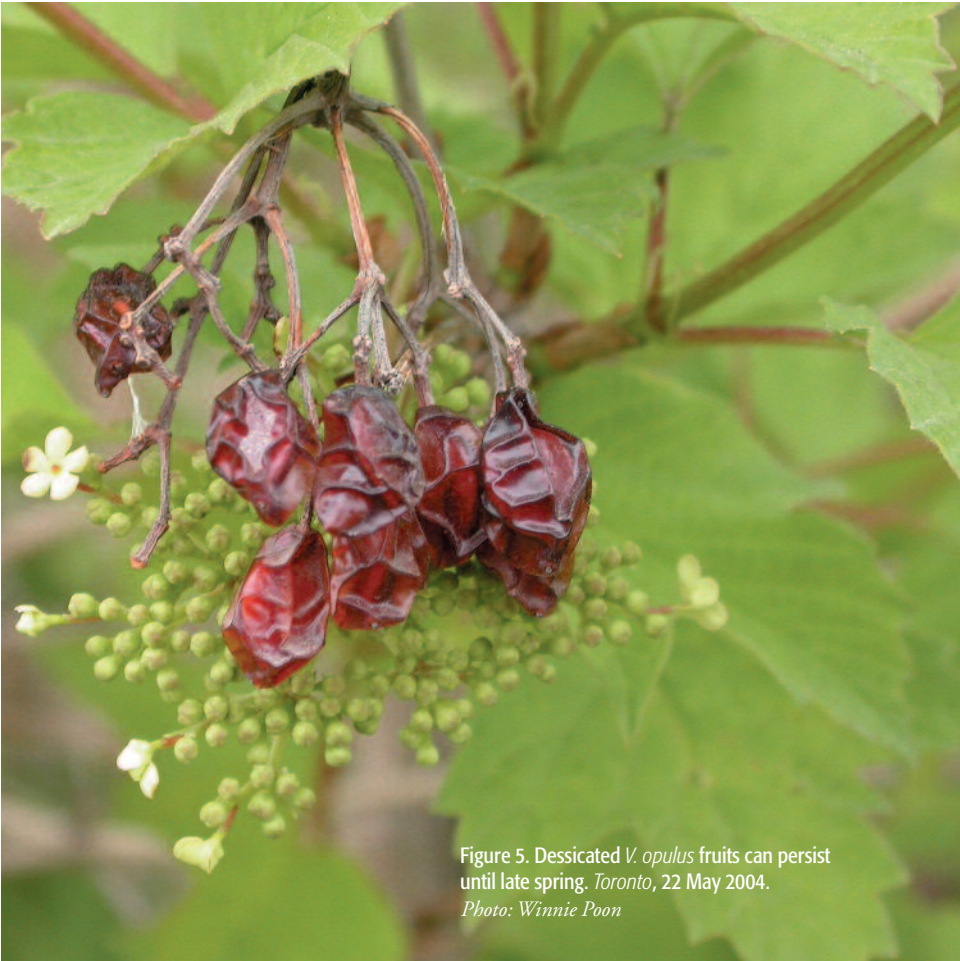
Figure 5. Dessicated V. opulus fruits can persist until late spring. Toronto, 22 May 2004.