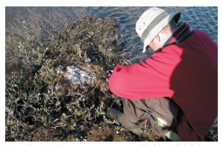
Figure 7: Colin Jones inspecting a Ross's Goose nest, 15 June 2005.

five hours in which we walked through this impressive Snow Goose colony, these were the only areas where we found evidence of breeding Ross's Geese.