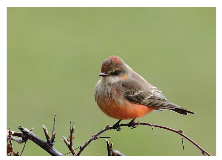
Figure 14: Vermilion Flycatcher at West Becher, Chatham-Kent on 27 December 2015.