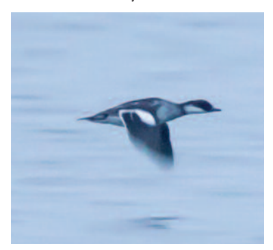
Figure 3: Smew at Cornwall, Stormont. Dundas and Glengarry on 14 December 2015.