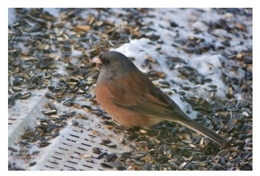
Figure 21: Pink-sided Dark-eyed Junco at Southworth, Kenora on 30 December 2015.