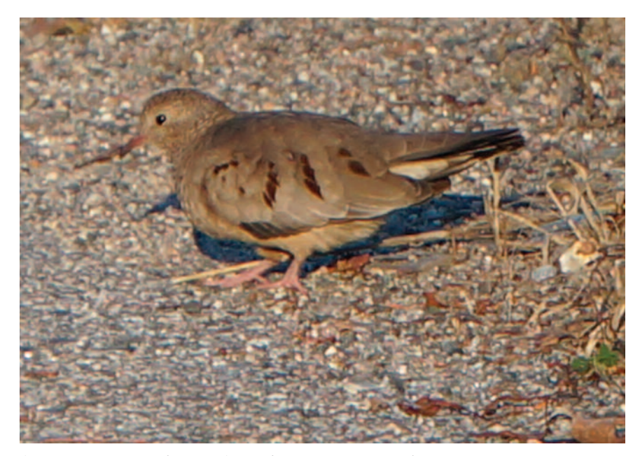
Figure 12: Common Ground-Dove at Sioux Lookout, Kenora on 8 November 2015.

2015 – one, first basic female, 8-9 November, Sioux Lookout, Kenora (Edith M. Burkholder, E. Merle Burkholder; 2015-100) – photos on file. This is just the fourth record for the province, with two others occurring in the Central Zone (Wormington 1987, Crins 2003) and one from the South (Richards 2009). This year's record coincided with several extralimital reports in the midwestern United States