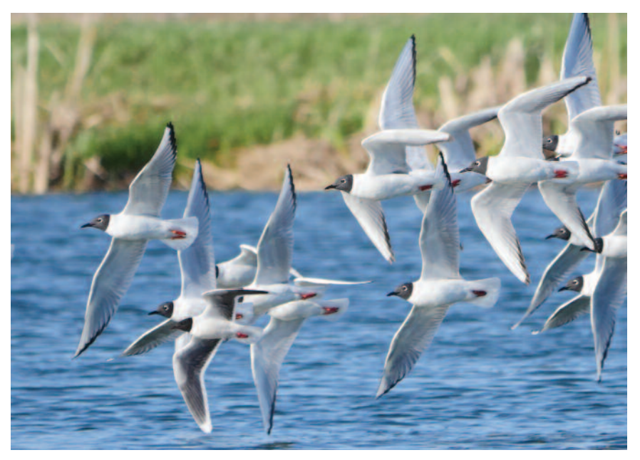
Figure 9: Little Gull with Bonaparte's Gulls at New Liskeard, Timiskaming on 14 May 2015.