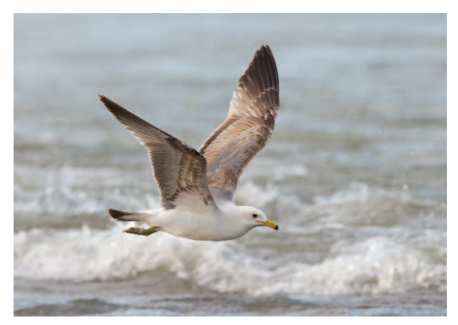
Figure 10: California Gull at Point Pelee National Park, Essex on 12 May 2015.