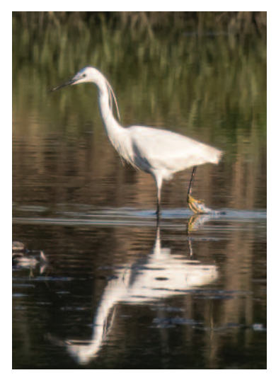
Figure 4: Little Egret at Carp, Ottawa on 2 June 2015.