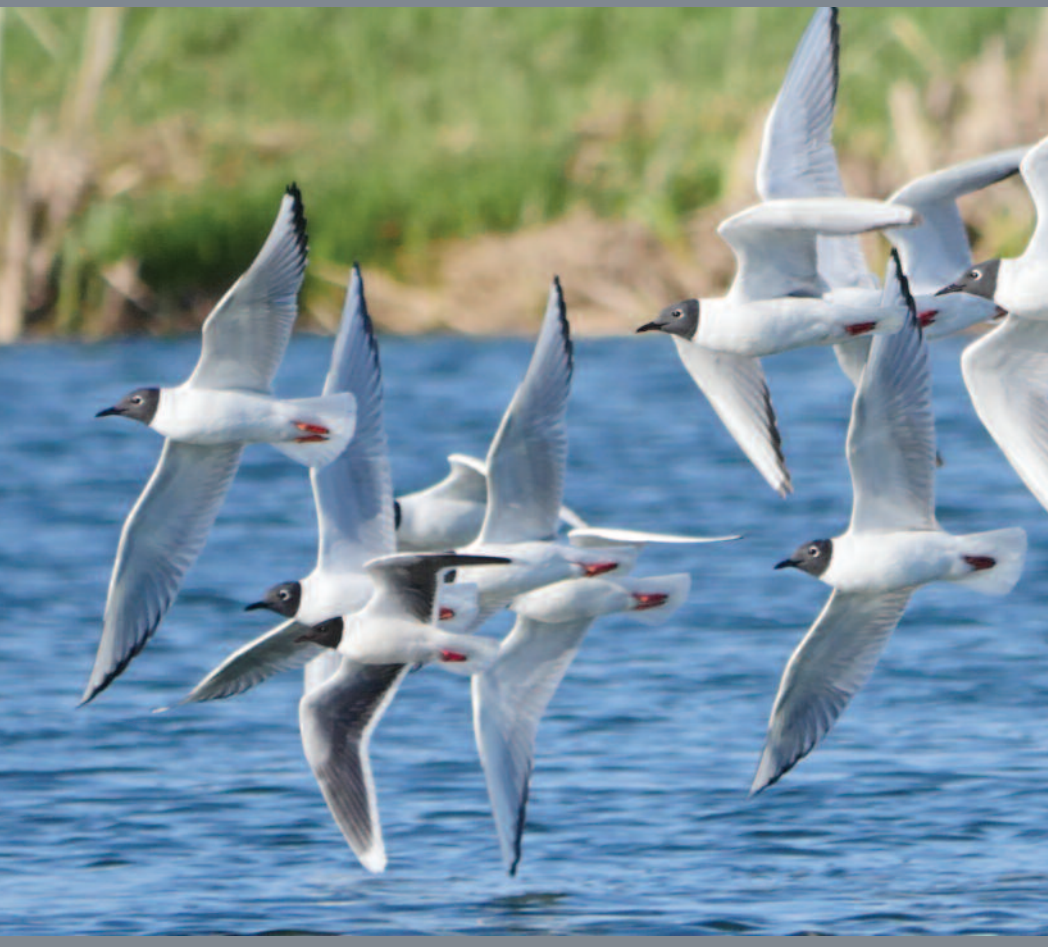
Little Gull with Bonaparte's Gulls, Timiskaming, May 2015.