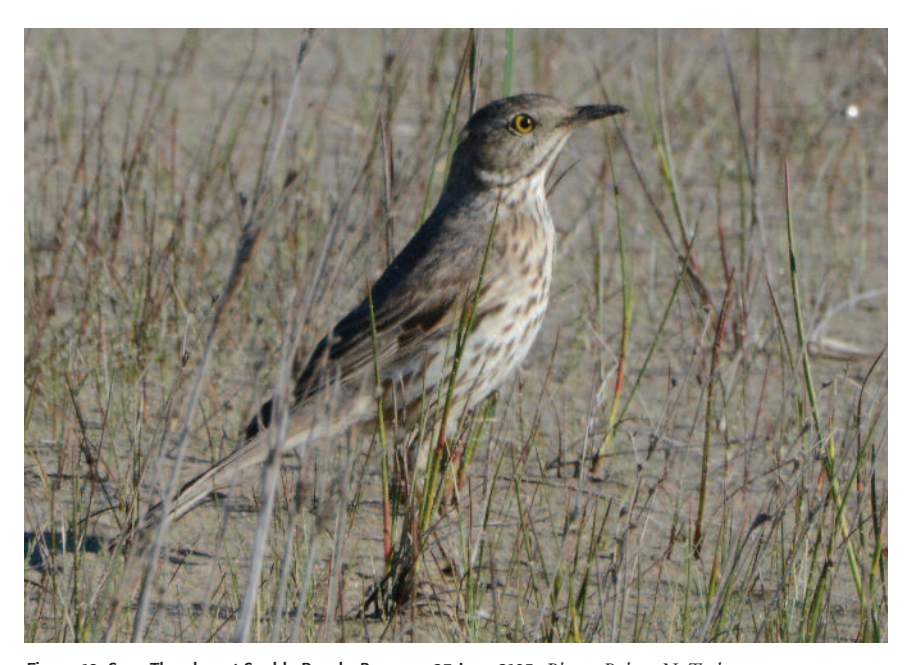
Figure 18: Sage Thrasher at Sauble Beach, Bruce on 23 June 2105.