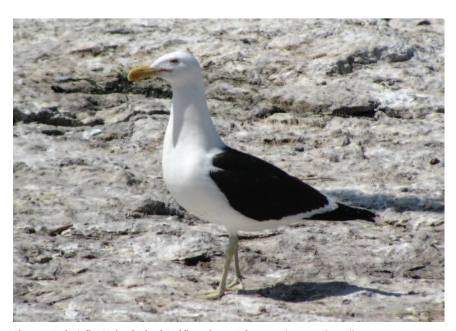
Figure 11: Kelp Gull at Mohawk Island, Haldimand on 12 July 2013.