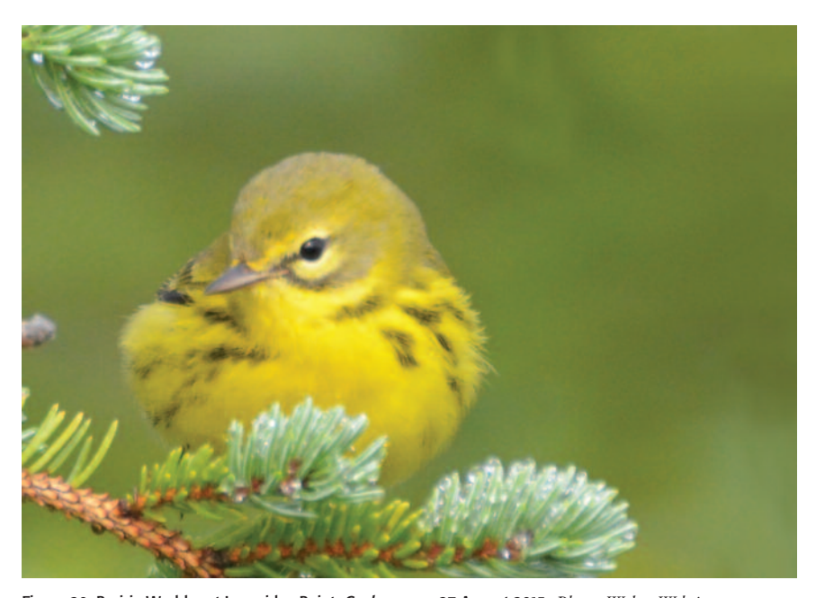
Figure 20: Prairie Warbler at Longridge Point, Cochrane on 27 August 2015.