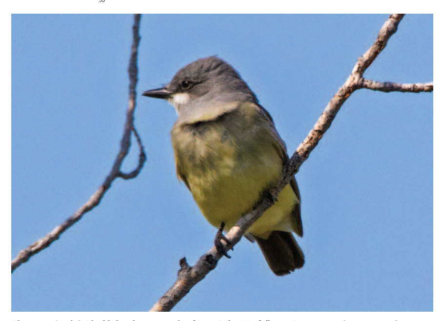
Figure 15: Cassin's Kingbird at the eastern tip of Long Point, Norfolk on 9 June 2015.