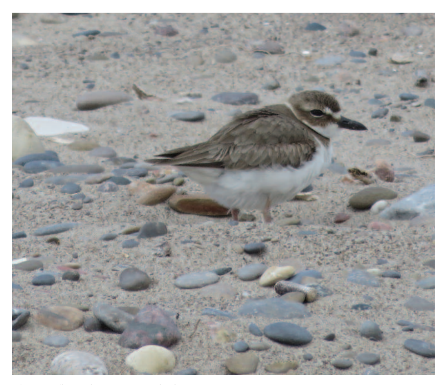
Figure 7: Wilson's Plover at Toronto Islands, Toronto on 29 May 2015.