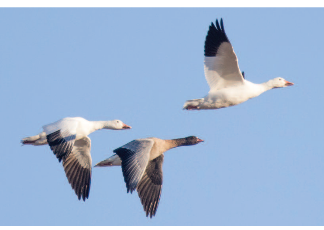
Figure 2: Pink-footed Goose with Snow Geese at Tayside, Stormont, Dundas and Glengarry on 31 October 2015.