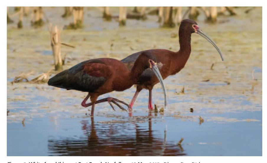
Figure 5: White-faced Ibises at Port Royal, Norfolk on 15 May 2015.

The Pelee/Blenheim bird was seen 9.5 hours apart, first flying over the tip of Point Pelee, then circling the Blenheim Sewage Lagoons, approximately 60km away. Plumage details allowed the Committee to be confident the same bird was involved in both sightings.