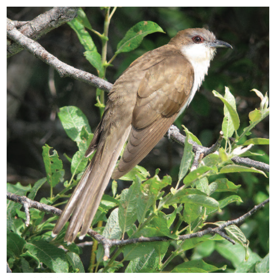
Figure 13: Black-billed Cuckoo at Longridge Point, Cochrane on 12 August 2015.