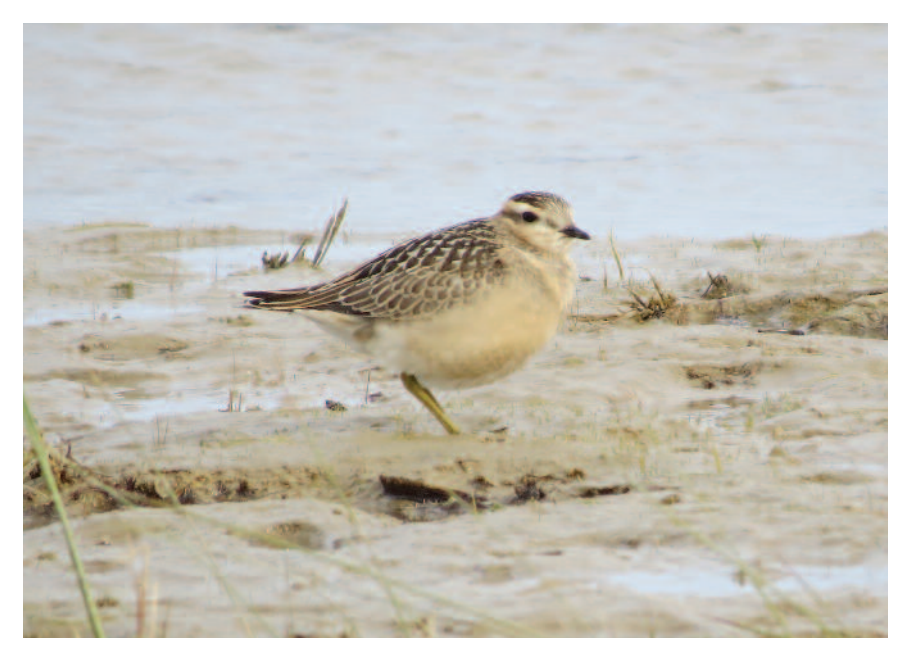
Figure 8: Eurasian Dotterel at Oliphant, Bruce on 3 October 2015.