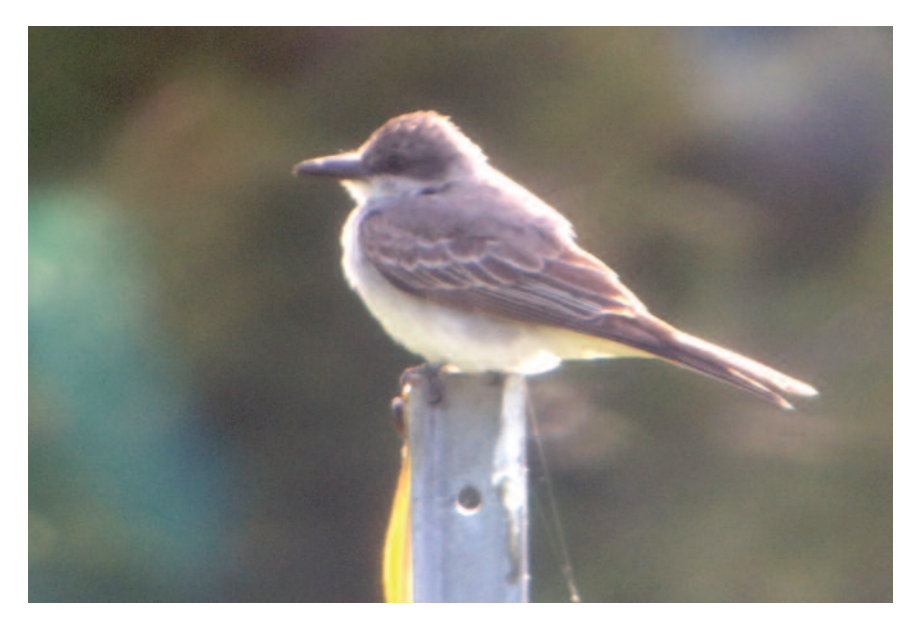
Figure 16: Gray Kingbird at Elmdale, Essex on 26 May 2015.