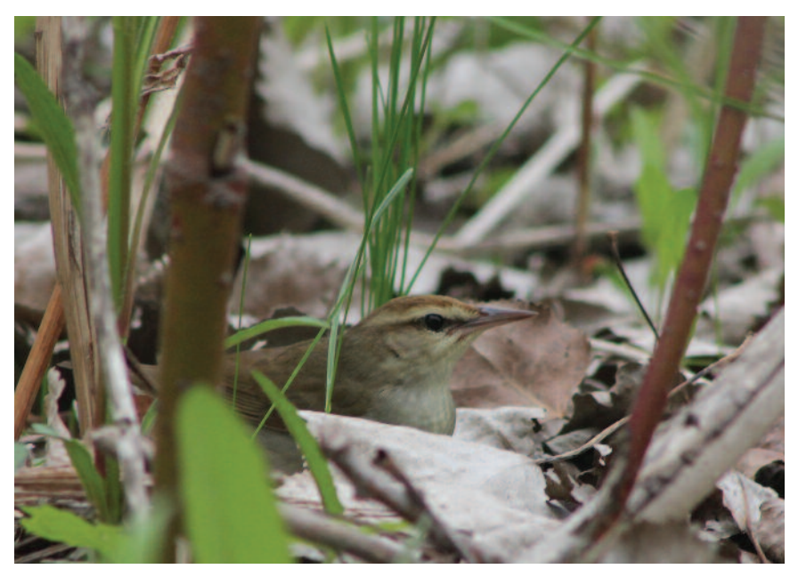
Figure 19: Swainson's Warbler at Leslie Street Spit, Toronto on 18 May 2015.