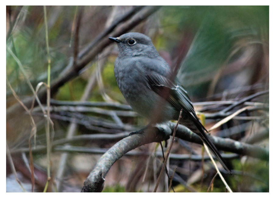
Figure 17: Townsend's Solitaire at Netitishi Point, Cochrane on 31 October 2013.