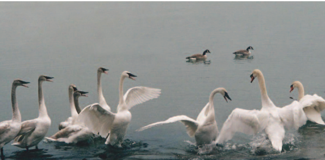
Figure 1. A Trumpeter Swan family confronts two Mute Swans at LaSalle Park, Burlington, Ontario.