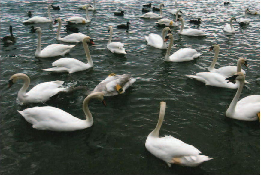
Figure 2. A mixed group of Trumpeter Swans and Mute Swans at LaSalle Park, Burlington, Ontario, on 22 March 2011. The trumpeter cygnet with yellow wing tag H88 is attacking an adult Mute Swan.

The attacks of both species were very brief, amounting to a single peck. Pecks by mutes were directed at the head of an opponent. The aggressor usually missed but sometimes gripped the neck of the opponent. In contrast, trumpeters directed their attacks at the body of the victim (Figure 2).