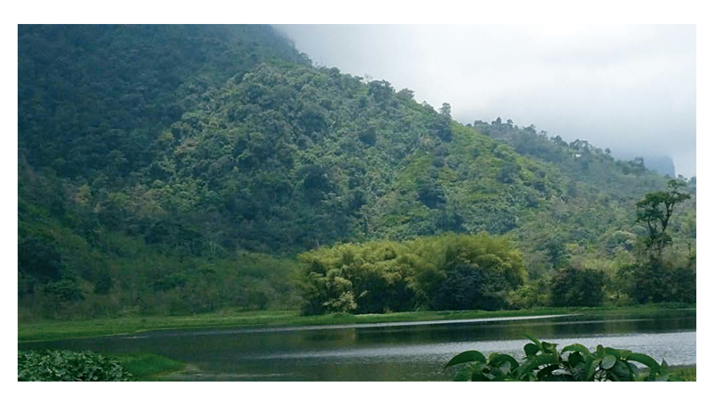
Figure 2. Our Cerulean Warbler study site where cardamom was harvested under canopy trees.

We deployed three principal methods to gather data on Cerulean Warblers: