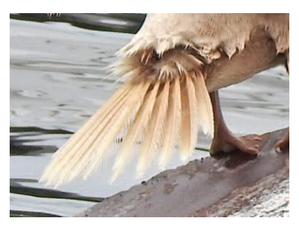
Figure 5. Tail feathers are worn to the shaft. 7 October 2018.

Close inspection of the cormorant's plumage shows that it is very worn compared to the neat, relatively unworn plumage of the normal juvenile cormorant beside it (Figure 2). Feathers on the upperparts are very scruffy at the tips, and tail feathers are worn to the shaft (Figure 5), indicating that it has not moulted recently. Feather replacement through moult is the only way to repair