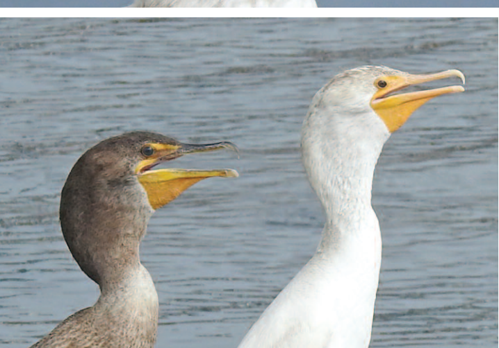
Figure 3. Bill, gular area and skin around the eye lack normal pigments. The irides are the normal bluishbrown. 9 October 2018.