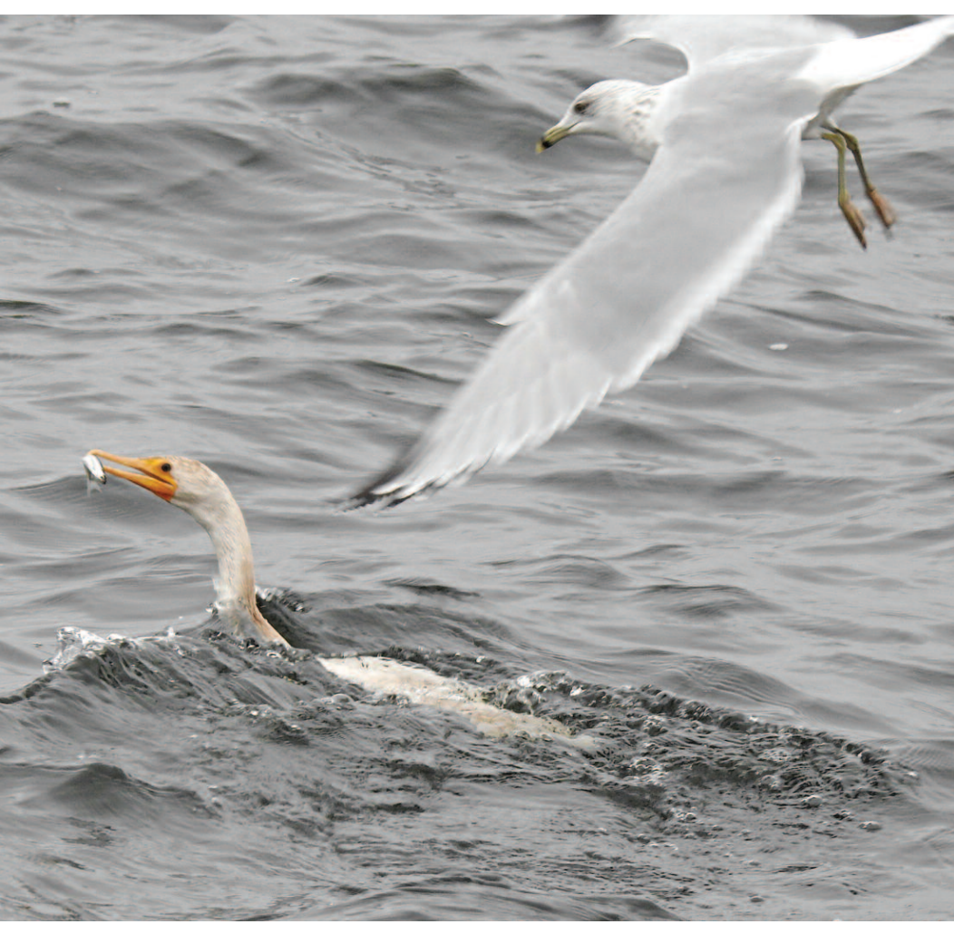
Figure 6. Ring-billed Gull attempts to steal a fish. 9 October 2018.

they could also probably see it below the surface. When it surfaced, several times gulls tried unsuccessfully to grab its prey (Figure 6). Having a pale plumage could be a disadvantage, making it more visible to predators or birds that might parasitize it.