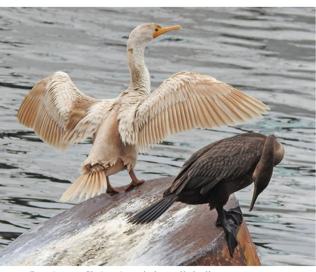
Figure 2. A mutant condition (see text) causes the plumage to bleach and be very worn. 7 October 2018.