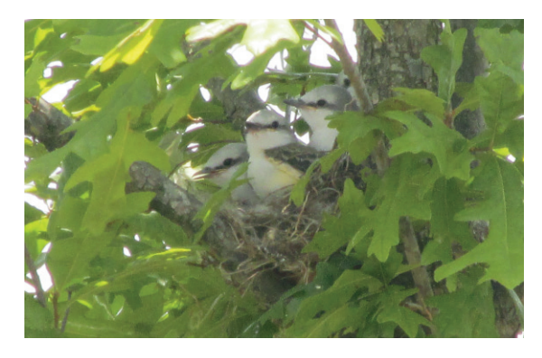
Figure 1. Scissor-tailed Flycatcher successfully nested in Robertsobn County, Tennessee; this nest represents the first documented nest there.