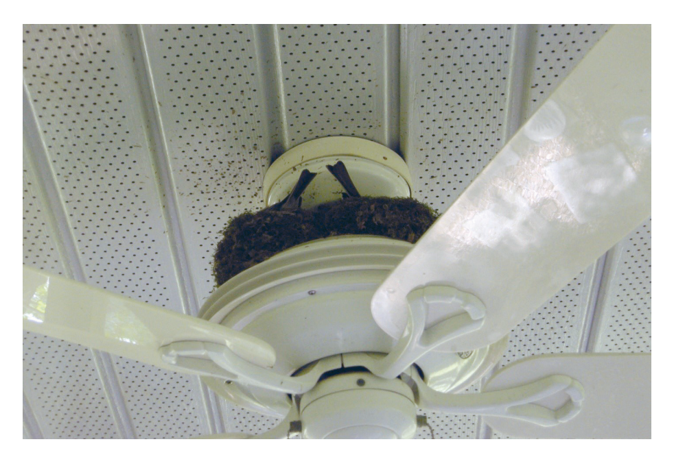
Figure 1. Eastern Phoebes (Sayornis phoebe) incubating in adjacent nests.

cubating the left nest, leaving the right nest unattended for a few minutes. We watched for another few minutes and saw two birds incubating at random on both nests, interchanging which nests they were incubating with no particular pattern that we could discern. We could not tell the birds from each other; they were not banded or marked in any way.