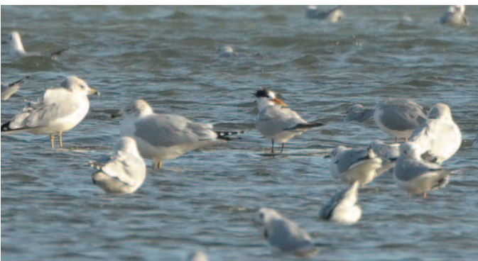
Figure 1. Elegant Tern first found off Beaver Island State Park, Grand Island, NY, on 20 November 2013.