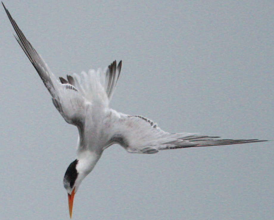
Figure 14. Elegant Tern plunge-diving over Black Rock Canal from Squaw Island Park, Buffalo, NY, on 22 November 2013.

more unbelievable is the fact that this particular individual accomplished this feat in only six to eight months after hatching. Foraging depends on location and season, and varies from offshore to nearshore in shallow lagoons and harbours. Migrant birds generally feed in harbours, estuaries, salt-ponds and lagoons while non-breeders commonly feed in lagoons and bays avoiding rough waters (del Hoyo et al. 1996). Its main food is schools of fish of five species and, very rarely, crustaceans (Shaffner 1986).