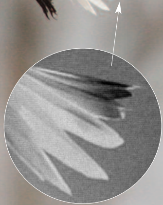
Figure 6. Elegant Tern over Black Rock Canal from Squaw Island Park, Buffalo, NY.