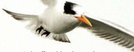
Figure 16. Elegant Tern over Black Rock Canal from Squaw Island Park, Buffalo, NY, on 22 November 2013.

It is of interest to note that in addition to the above sightings away from the Pacific coast, the Elegant Tern has been recorded several times in the Old World. Vagrants are reported in Europe from Belgium, Denmark, England, Germany, France, the Netherlands, Northern Ireland, Portugal and Spain (AOU 1998, Burness et al. 1999, Kwater 2001, Shoch and Howell 2013). In addition, one or more Elegant Terns have bred with ‘Eurasian’ Sandwich Terns in France from 1974 to 1985 (Olsen and Larsson 1995). Two additional records are also known from South Africa and Argentina (Kwater 2001).