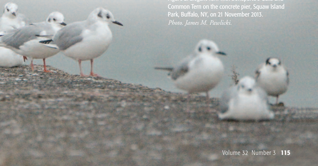
Figure 2. Elegant Tern with Bonaparte's Gulls and Common Tern on the concrete pier, Squaw Island Park, Buffalo, NY, on 21 November 2013.

At 1250h on 20 November 2013, Victoria Rothman of Youngstown, New York was bird-watching along the New York side of the Niagara River at Beaver Island State Park on Grand Island, Erie County. Weather conditions at the time were sunny with light east winds and temperatures around 4.5°C. While observing a flock of gulls sitting in the rocky shallows just offshore, she discovered a medium-sized tern with a bright orange bill that she identified as either an Elegant or Royal Tern ( Thalasseus maximus ). Knowing the great rarity of the bird regardless of species, she made a cell phone call to James Pawlicki. After describing field marks over the phone, it became evident that certain features, notably the small body size and thin bill, suggested that it was an Elegant Tern rather than Royal Tern, despite the latter being arguably the more likely of the two species to occur in the region.