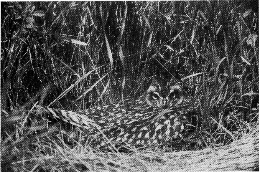
Figure 2: Short-eared Owl brooding young on nest in Grey County, 15 June 1993.

Outside diameters of 3 nests ranged from 22 to 29 cm (8.7 to 11.4 inches); inside diameters from 12.7 to 16 cm (5 to 6.3 inches); and inside depths from 3 to 5 cm (1.2 to 2 inches). One of these nests was a substantial mound of dried grasses with an outside depth of 7.6 cm (3 inches).