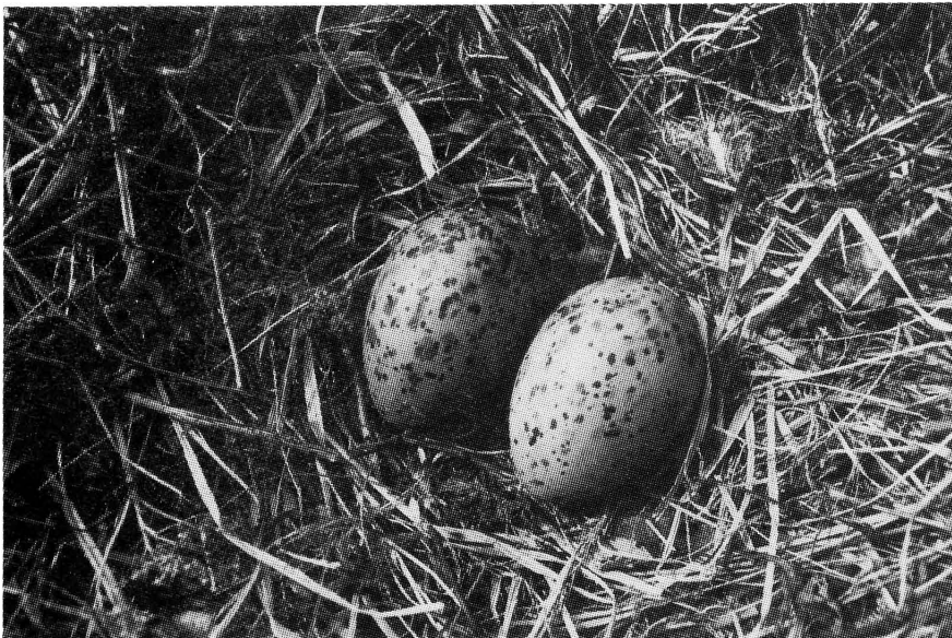
Figure 1: Nest and two eggs of Great Black-backed Gull, 17 May 1989, Little Haystack Island, Bruce County.