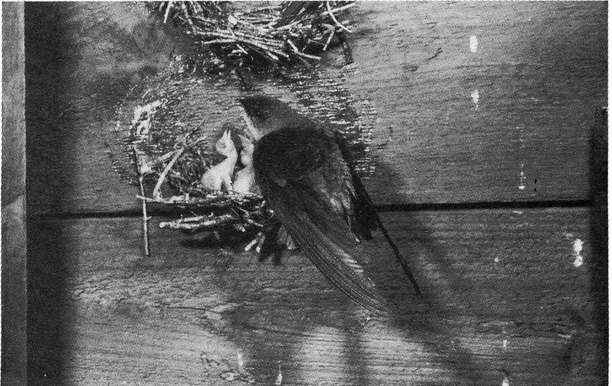
Figure 3: Chimney Swift at nest containing four young in tobacco shed, 24 June 1982, in Durham R.M.

132 records (150 nests) representing 32 provincial regions. An old nest record from Northumberland (1902) and a recent one from Lambton (1985) have been added.