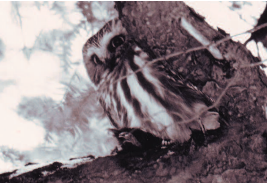
Figure 2. Northern Saw-whet Owl with Star-nosed Mole (large hind foot visible), 29 January 1984, Lynde Shores Conservation Area, Durham R.M.