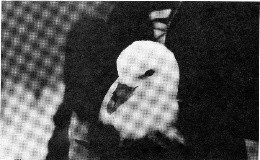
Figure 1: Northern Fulmar at Moosonee on 30 November 1992.

Conditions at the time of capture were quite severe. Temperatures were well below freezing and there was approximately 2 feet (0.7 m) of snow on the ground. The day prior to the capture, the last of the Moose River adjacent to Moosonee had frozen. The capture location was less than 200 metres from the River but would have been one half mile from the last open water. The townsite of Moosonee is located approximately 12 km up the Moose River from James Bay (at 51° 17'N & 80° 39'W).