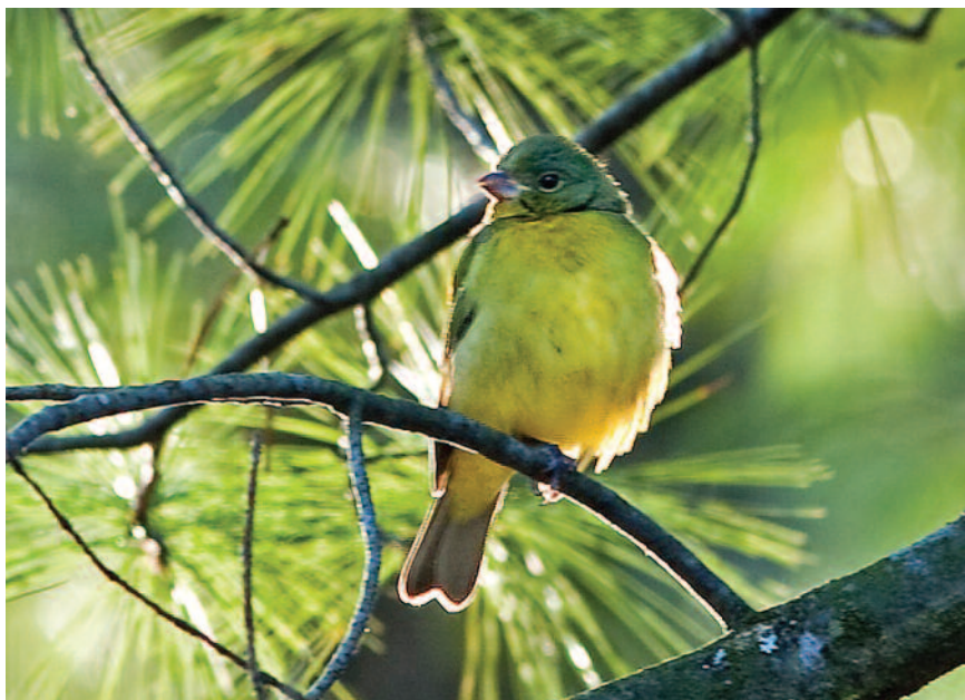
Figure 24. Painted Bunting at Miners Bay, Haliburton on 24-25 November 2010.