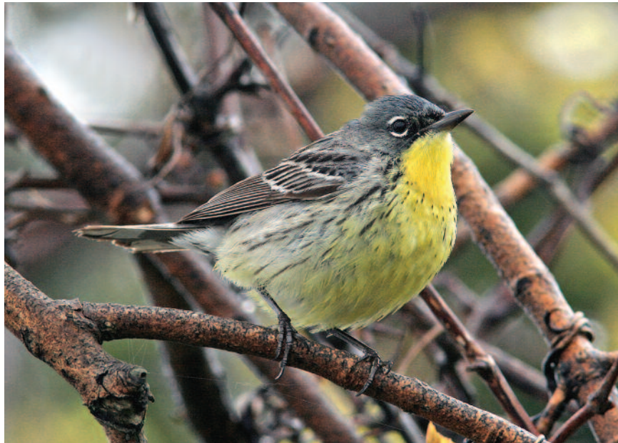
Figure 18. Kirtland's Warbler on 22-23 May 2010 at Point Pelee National Park, Essex.