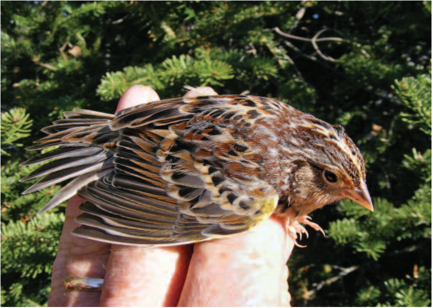
Figure 21. This Grasshopper Sparrow that was caught for banding at Thunder Cape, Thunder Bay , was present 18-21 October 2010.