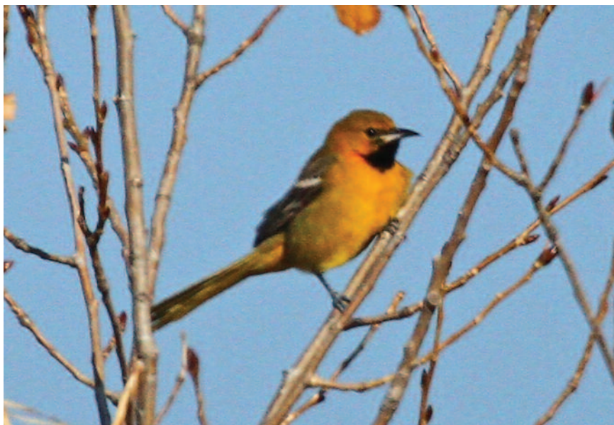
Figure 25. Immature male (first basic) Hooded Oriole at the Tip of Long Point, Norfolk , on 8 November 2010.