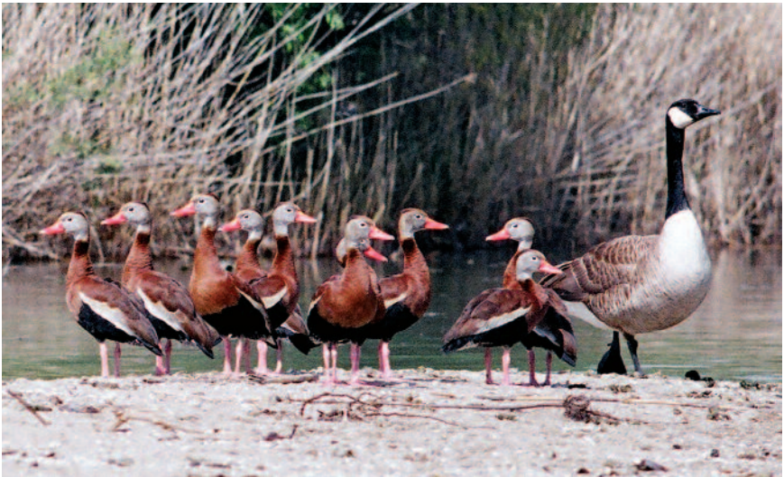
Figure 2. A flock of ten Black-bellied Whistling-Ducks at Windsor (Pêche Island), Essex on 15 May 2010.

Unfortunately these birds were seen after sunset and only in flight, thus a specific identification could not be made.