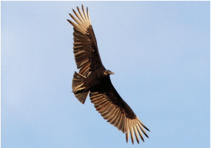
Figure 10. Black Vulture at Hamilton (Valley Inn), Hamilton on 21 April 2010.