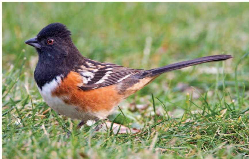
Figure 20. Male Spotted Towhee of the arcticus subspecies, at Port Rowan, Norfolk , where it was present from 13 November 2010 to 24 January 2011.