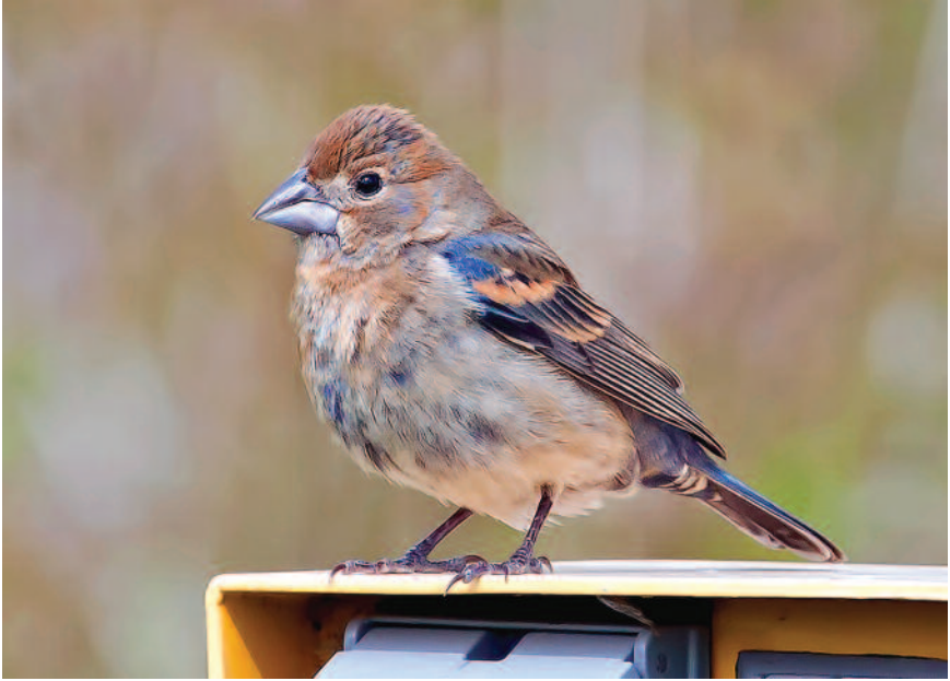
Figure 23. Female Blue Grosbeak at Rondeau Provincial Park, Chatham-Kent, on 8-15 May 2010.