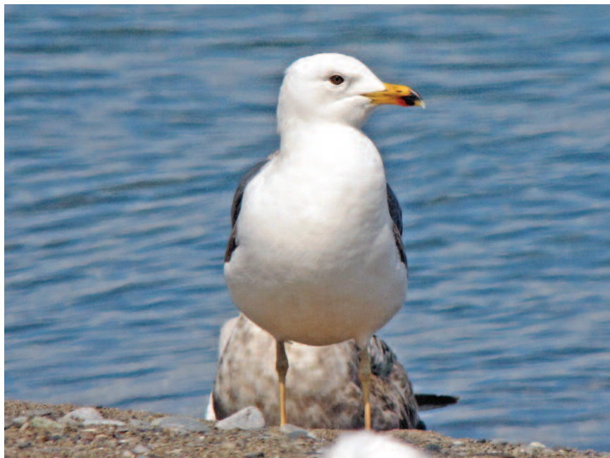
Figure 12. Third alternate California Gull at Wheatley Harbour, Chatham-Kent on 6 May 2010.