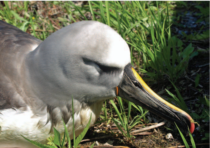
Figure 4. "Atlantic" Yellow-nosed Albatross at Wolfe Island (Browns Bay), Frontenac on 17 July 2010.

This is certainly one of the most interesting species ever to be found in Ontario. A complete account of this remarkable occurrence has been published by Martin