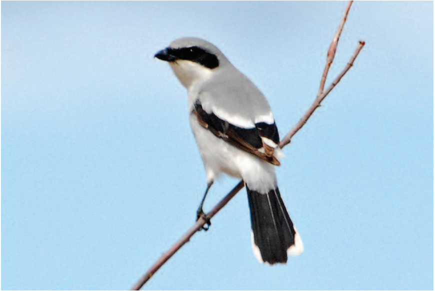
Figure 15. Loggerhead Shrike at Thunder Bay (Chippewa Landfill), Thunder Bay , on 3-5 May 2010. Note the brown primary feathers, indicating the bird is in first alternate plumage.