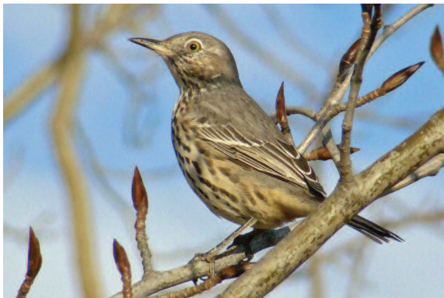
Figure 17. Sage Thrasher at Thunder Bay (Mission Island), Thunder Bay on 9 October 2010.