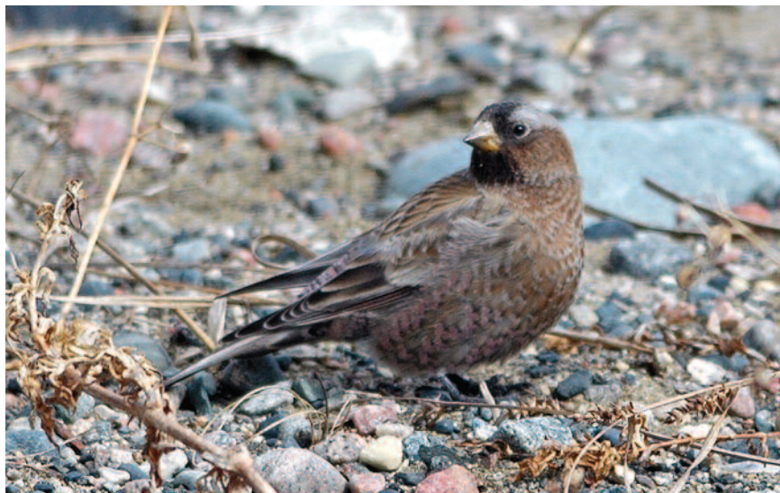
Figure 26. Gray-crowned Rosy-Finch at Marathon, Thunder Bay , where it was present from 20 December 2009 to 13 March 2010.