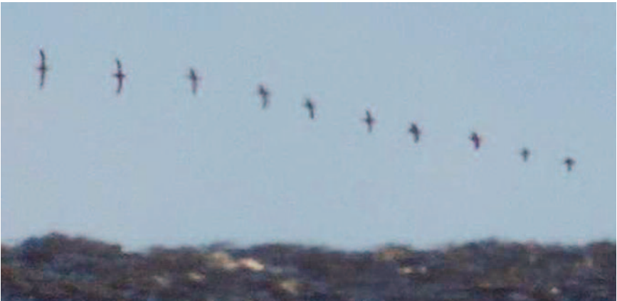
Figure 5. A composite image of the Sooty/Short-tailed Shearwater flying over the waters of southern James Bay at Netitishi Point, Cochrane, on 13 November 2010.