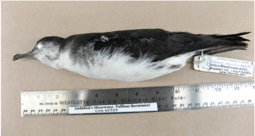
Figure 6. The Audubon's Shearwater that was found dead on 8 September 1975 at Almonte, Lanark; the specimen resides at the Canadian Museum of Nature (Ottawa).

Although this Audubon's Shearwater is the sole record for the province, it is not new to the Checklist of Ontario Birds since it had already been listed based on this known specimen.