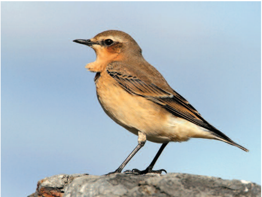
Figure 16. Northern Wheatear at Petrie Islands, Ottawa on 16 October 2010.