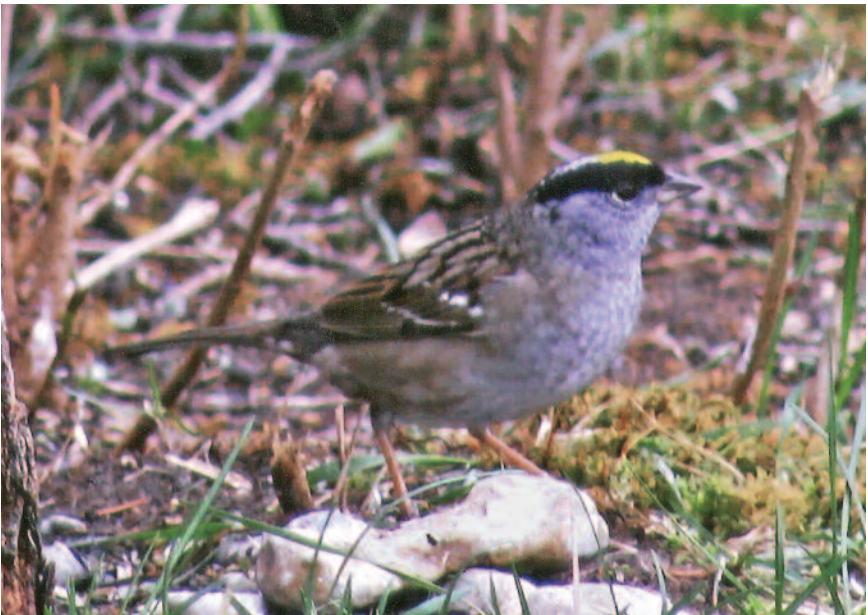
Figure 22. Golden-crowned Sparrow at West Bay, Manitoulin on 3-6 May 2010.