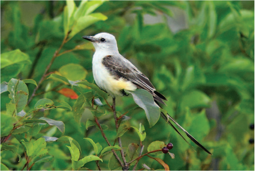
Figure 14. Adult Scissor-tailed Flycatcher at Monticello, Dufferin , that remained from 2 August to 1 September 2010.