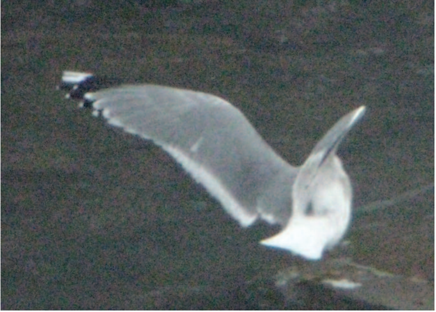
Figure 11. Adult Mew Gull (nominate canus group) at Queenston, Niagara on 6-7 January 2010. Note the diagnostic wing-tip pattern.