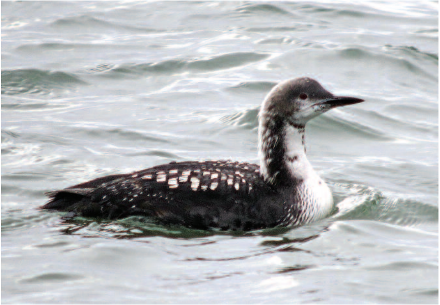
Figure 3. One of three adult Pacific Loons that were at Oshawa, Durham , during the fall of 2010; this individual was present 29 October to 9 November.