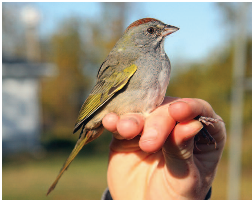
Figure 19. Green-tailed Towhee at Long Point Tip, Norfolk on 21-25 October 2010.