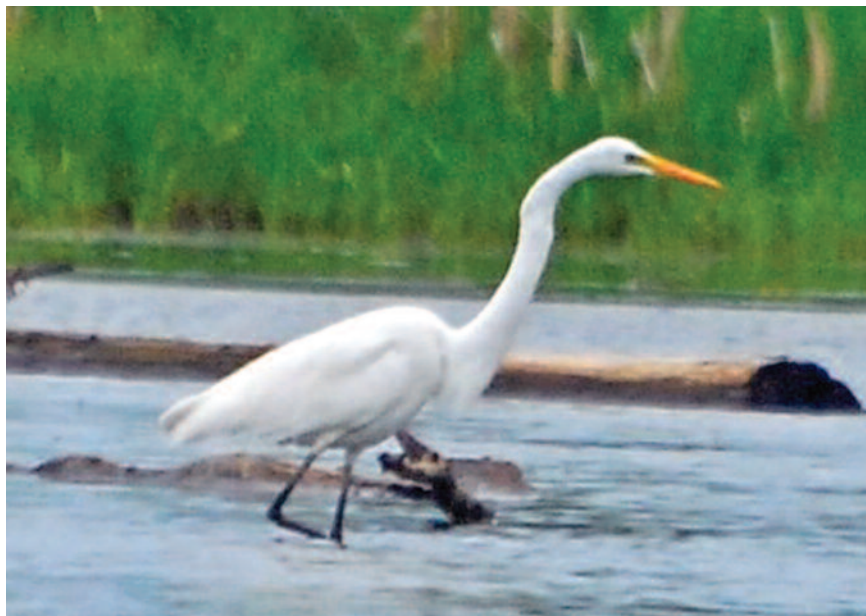
Figure 7. Great Egret at Thunder Bay (Mission Island Marsh), Thunder Bay on 5-10 June 2010.