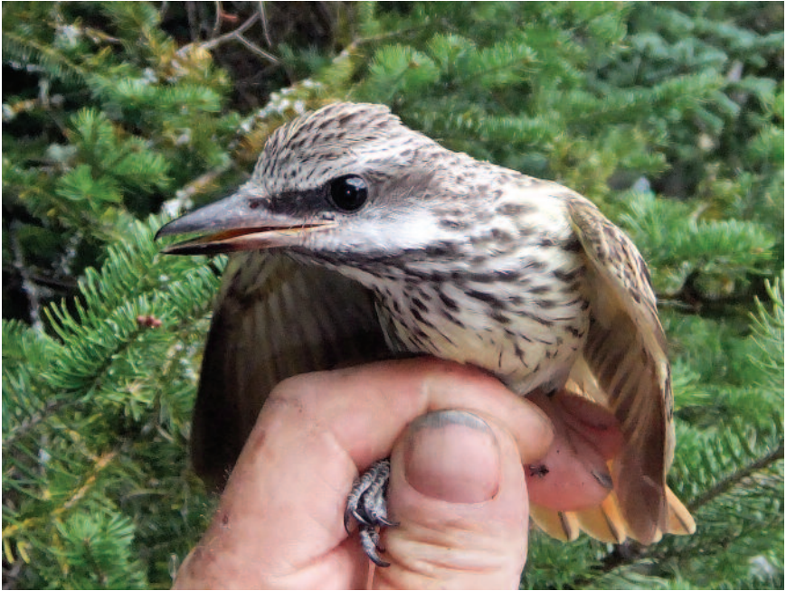
Figure 13. Ontario's third Sulphur-bellied Flycatcher, at Thunder Cape, Thunder Bay on 30 September 2010.