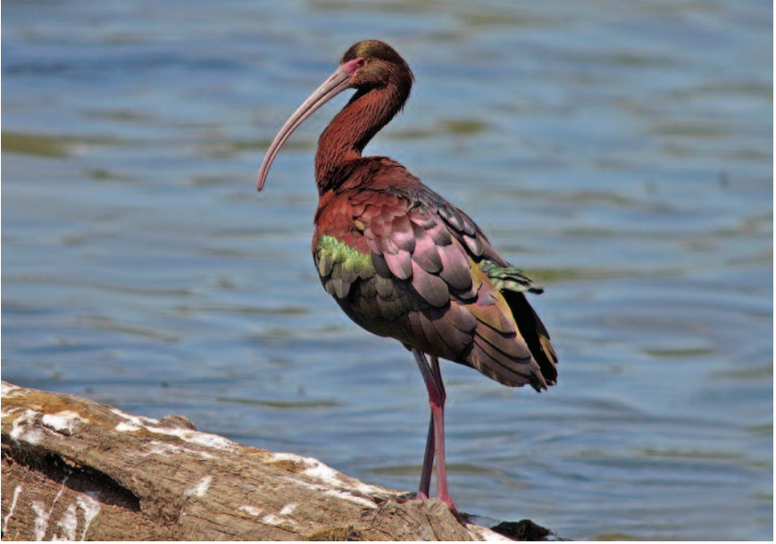
Figure 9. This immature (first alternate) White-faced Ibis remained at Big Creek Marsh, Essex from 25 April to 10 May 2010.