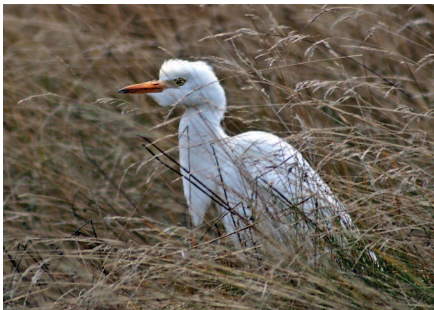
Figure 8. Cattle Egret at Wawa, Algoma on 8-12 November 2010.