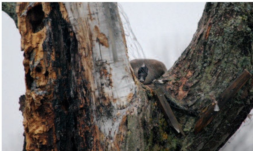
Figure 4. Incubating Canada Goose on nest in lower crotch of tree, exhibiting low profile, 29 April 2013.

The female generally selects the nest site and incubates the eggs (Baldassarre 2014), although males typically remain in the vicinity of the nest site throughout incubation (Mowbray et al. 2002). During our observations, while the female was on the nest, there was almost always a sentinel bird in the adjacent pasture or crop field. Usually this bird, presumably the pair male, was between 50-200 m away from the nest tree. While this bird would sometimes flatten down to the ground and remain hidden when observers initially arrived, it would more typically become quite alert, vocal and excited upon arrival of the observers. However, it never approached close to the nest while the observers were in the vicinity, and never displayed the aggressive nest defense behaviour more typical of male behaviour at ground nests. Both birds were seen together in the tree only once, in 2016.