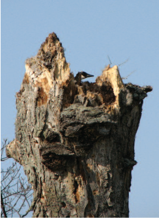
Figure 2. Incubating Canada Goose on tree nest in Glenelg Township, 27 April 2008.

Observations on nesting success were usually possible because this was a working farm and the nest and adjacent fields were observed periodically throughout the spring (DA). Actual observations of nest contents were only made occasionally