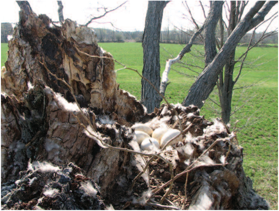
Figure 3. Tree-top perspective of the 2008 Canada Goose nest in a dead sugar maple tree, Glenelg Township.

In 2008, the nest contained five eggs, with a base of wood litter and debris (Figure 3). The nest site provided an almost-360° view of the surrounding agricultural landscape, meeting one of the prime Canada Goose nesting requirements which is good visibility over the surrounding terrain (Baldassarre 2014). There was very little down in the nest, as the site was wind-exposed and most of the down had blown away. Eggs of giant Canada Geese in elevated nests, such as those in nest boxes in Manitoba, typically cool more quickly than those in ground nests (e.g., Cooper 1978). Nest sites are more typically selected to minimize wind exposure and maximize retention of solar energy (Mowbray et al. 2002).