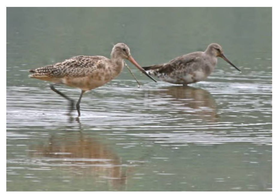
Figure 3. Marbled Godwit (left) and Hudsonian Godwit, 8 Sep 2011, Rankin Bottoms, Cocke County, Tennessee.