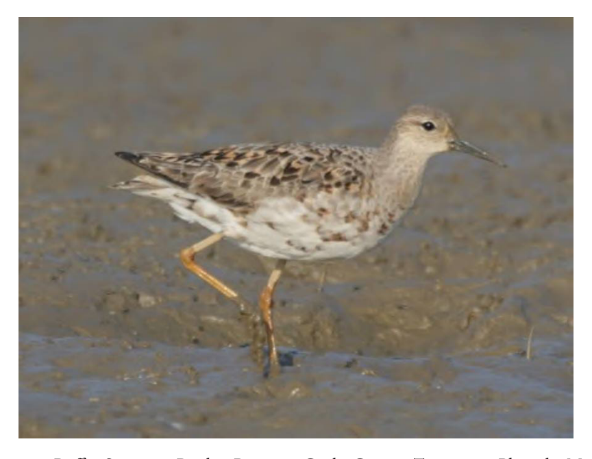
Figure 4. Ruff, 1 Sep 2011, Rankin Bottoms, Cocke County, Tennessee.