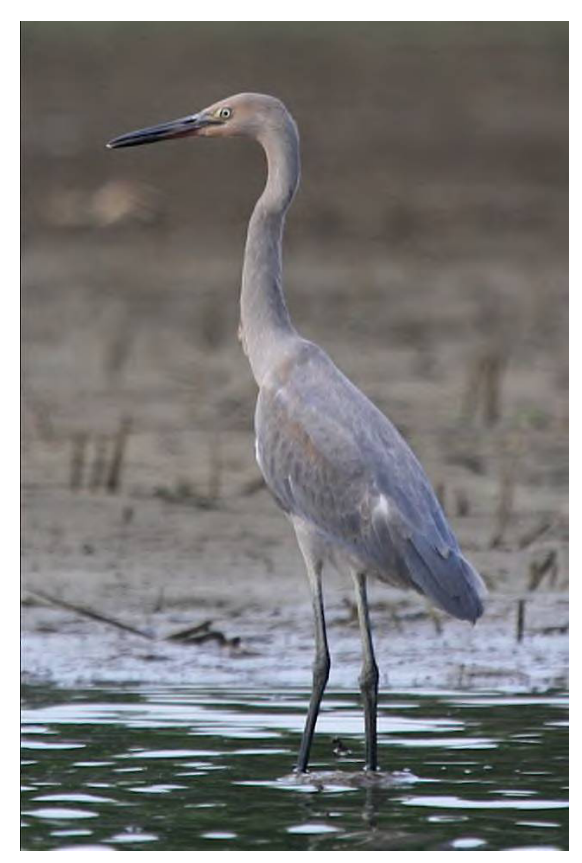
Figure 1. Reddish Egret, 12 Jul 2008, Rankin Bottoms, Cocke County, Tennessee.