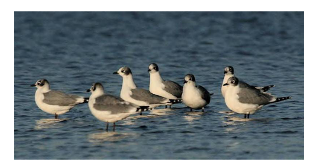
Figure 5. Franklin's Gulls, 25 Oct 2008, Upper Douglas Lake, Cocke County, Tennessee.