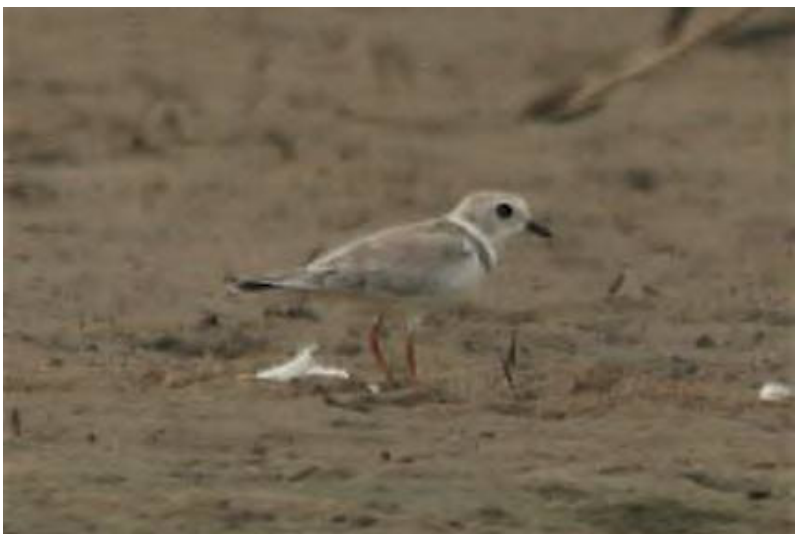
Figure 2. Piping Plover, 9 Aug 2008, Rankin Bottoms, Cocke County, Tennessee.