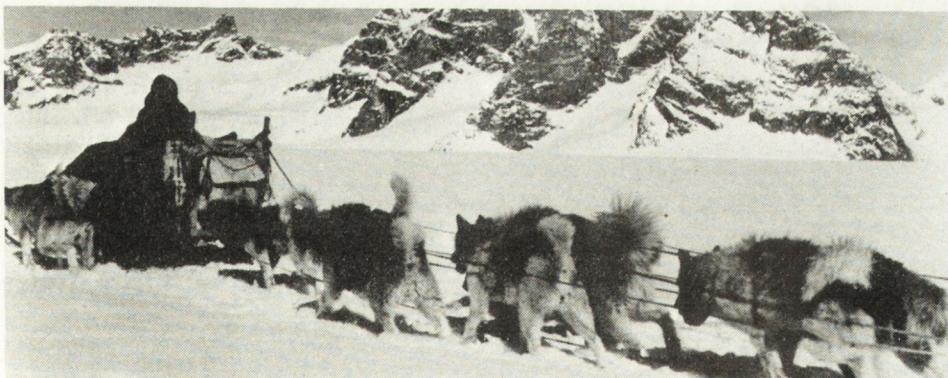
Dog sled team in East Greenland